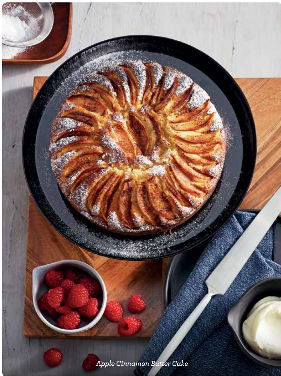
Apple Cinnamon Butter Cake