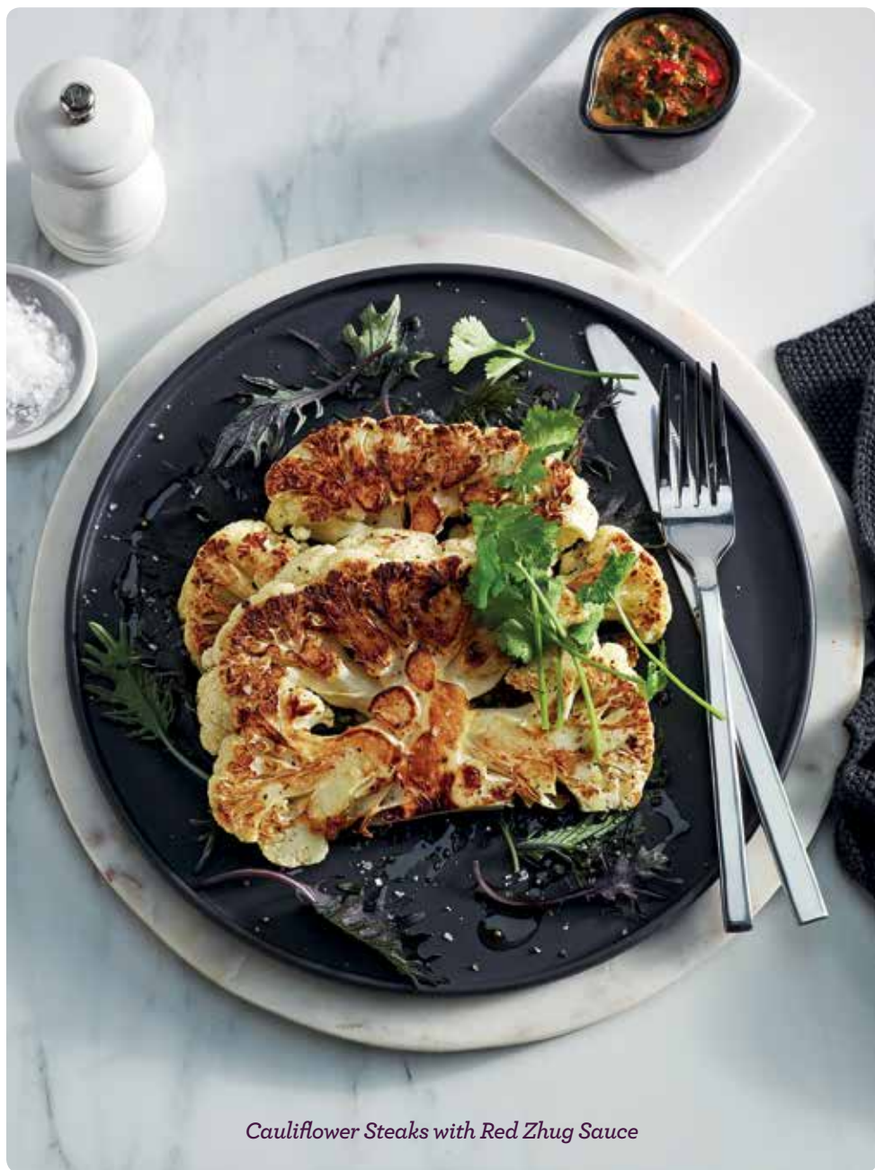
Cauliflower Steaks with Red Zhug Sauce