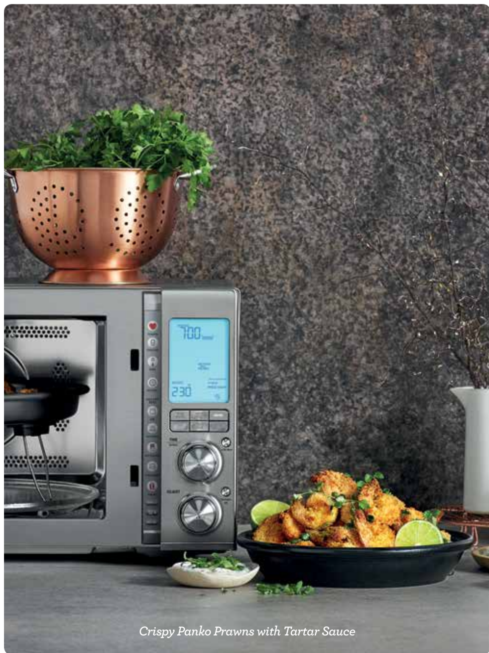
Crispy Panko Prawns with Tartar Sauce