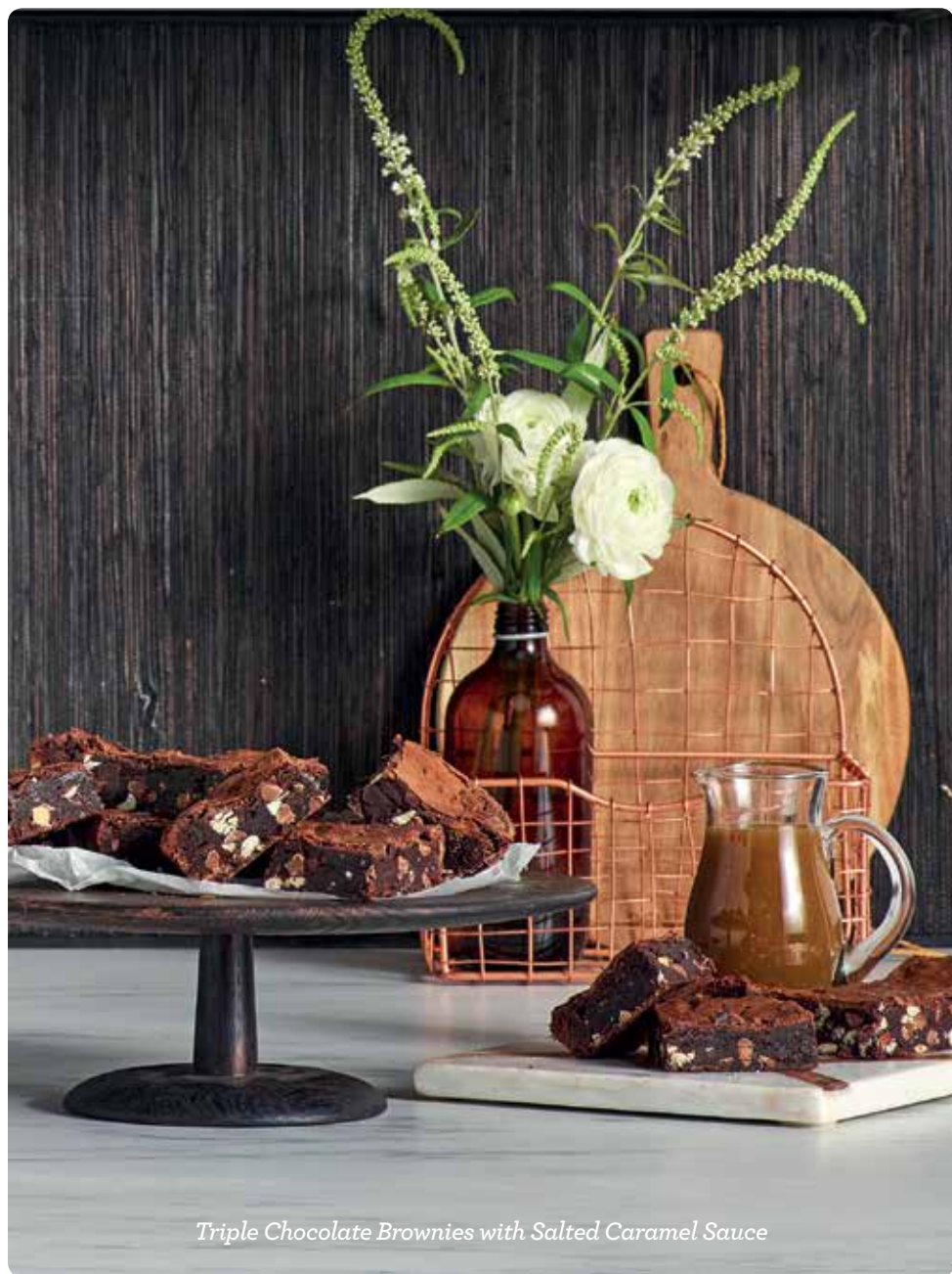
Triple Chocolate Brownies with Salted Caramel Sauce