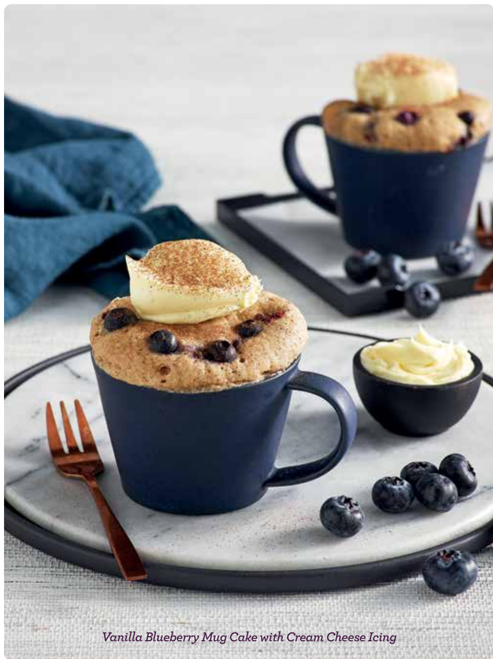
Vanilla Blueberry Mug Cake with Cream Cheese Icing