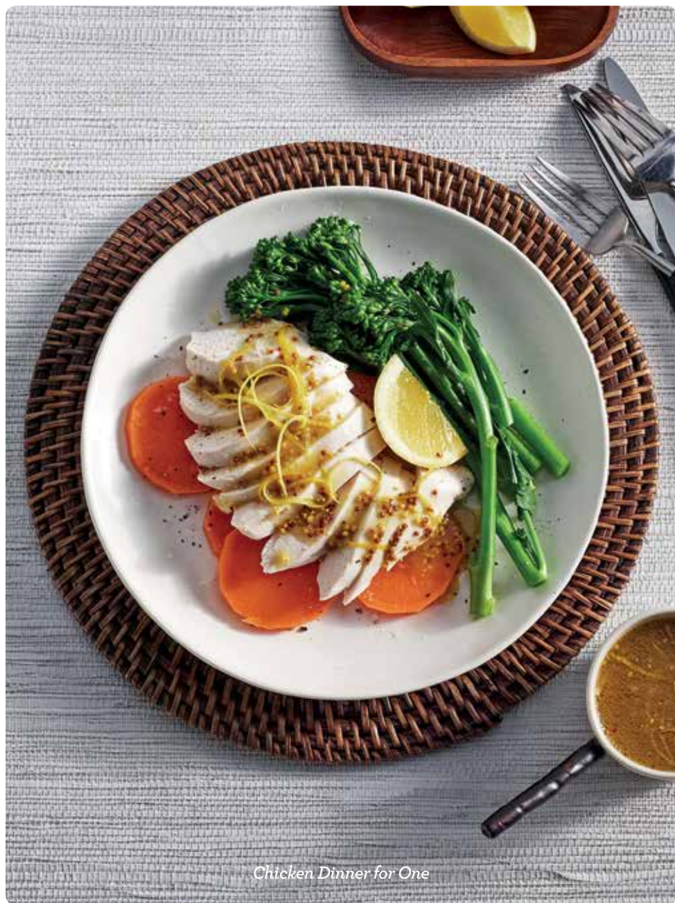
Chicken Dinner for One