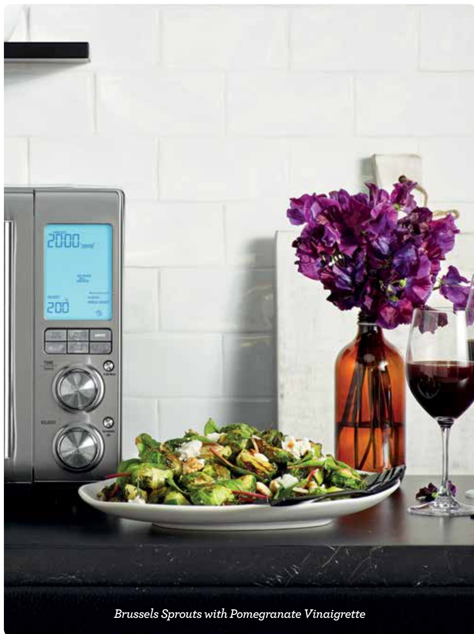
Brussels Sprouts with Pomegranate Vinaigrette