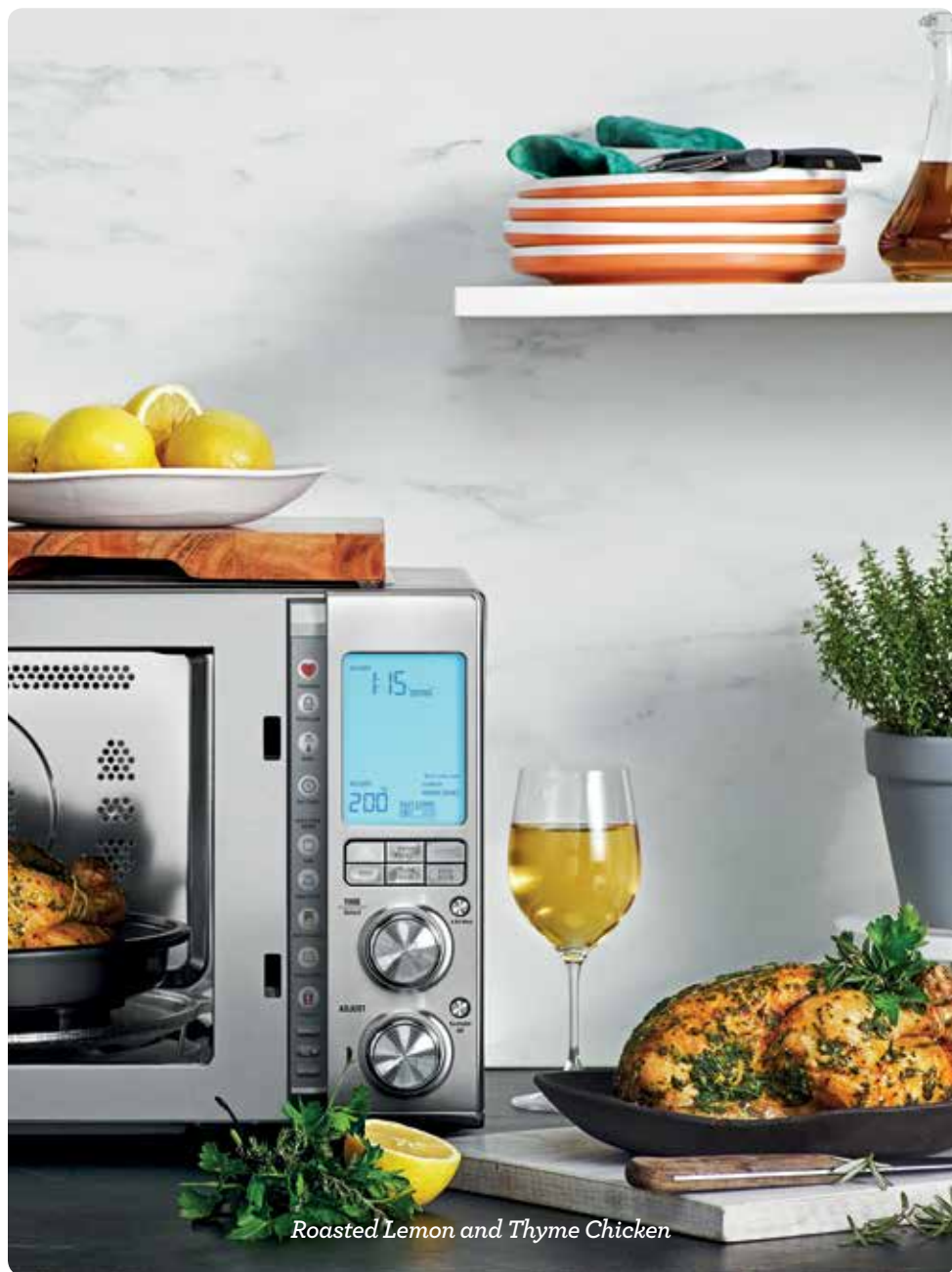
Roasted Lemon and Thyme Chicken