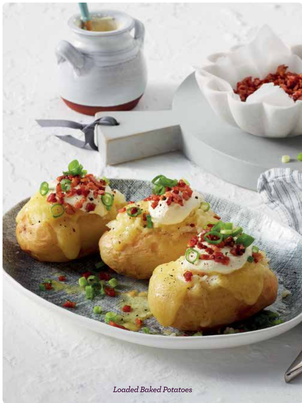
Loaded Baked Potatoes