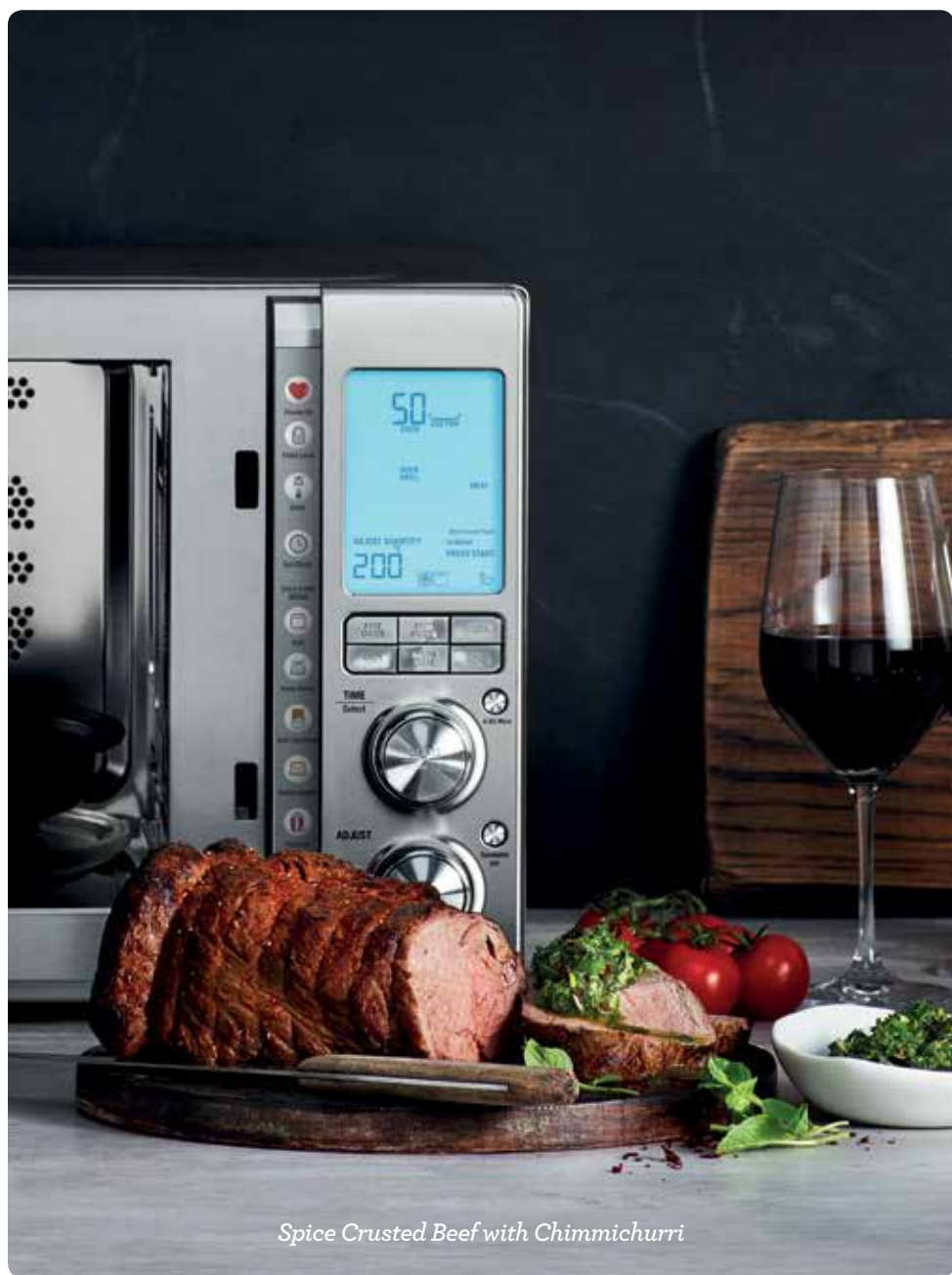
Spice Crusted Beef with Chimmichurri