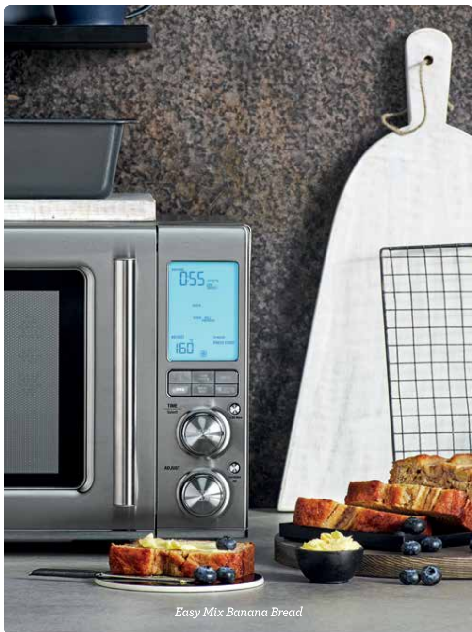
Easy Mix Banana Bread