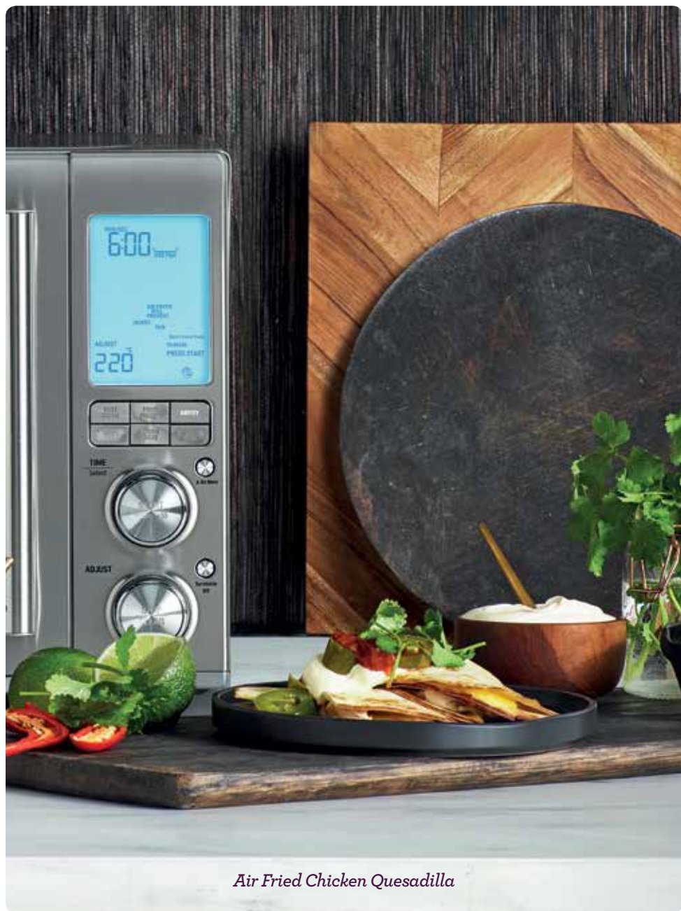
Air Fried Chicken Quesadilla