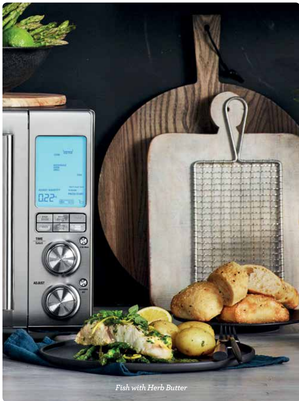
Fish with Herb Butter