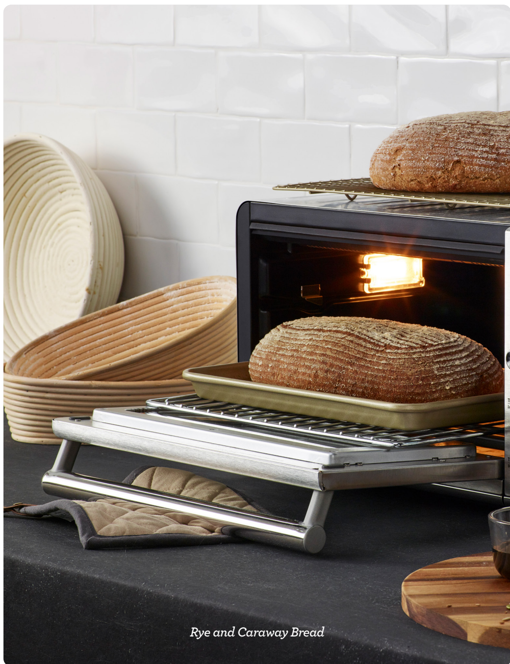
Rye and Caraway Bread