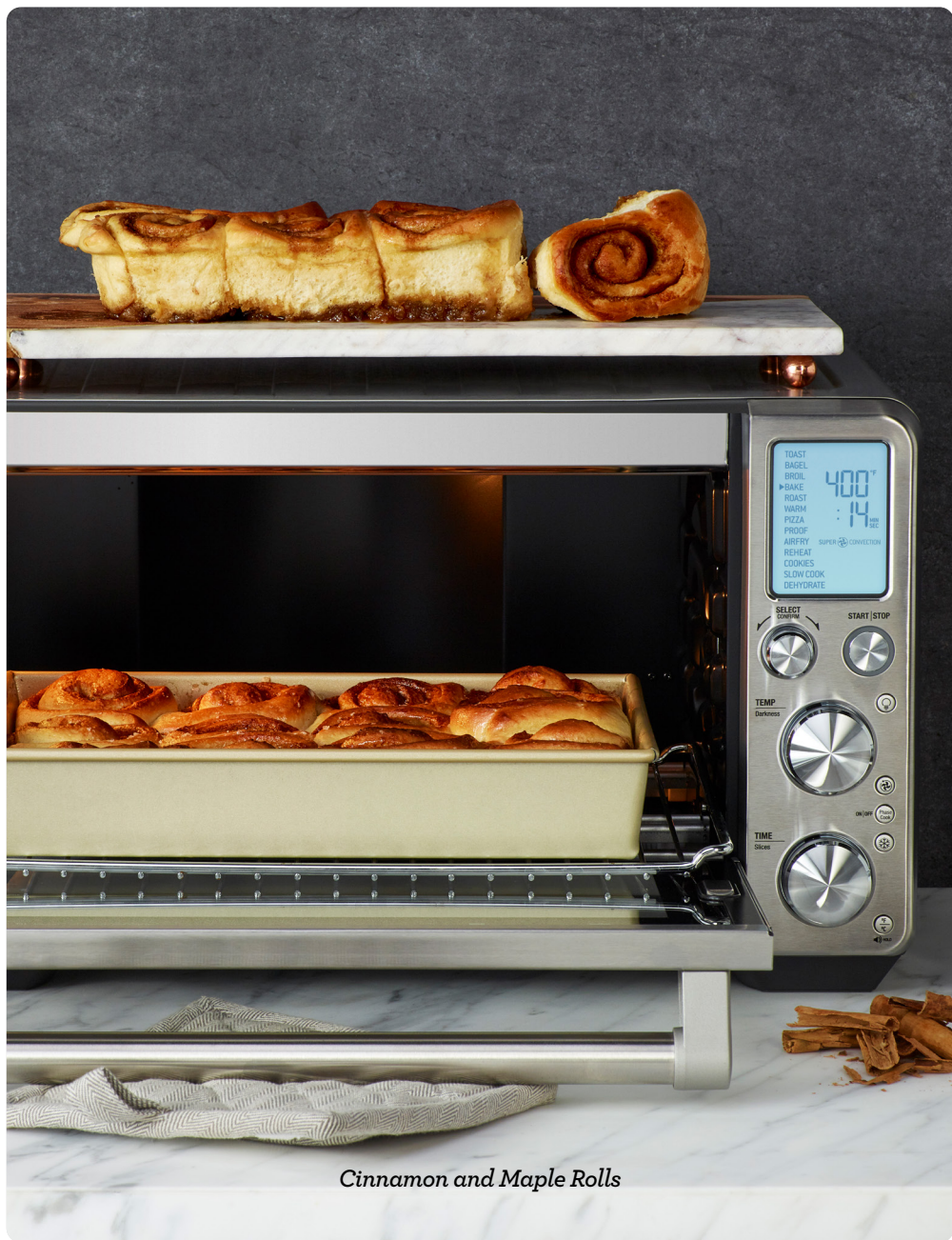
Cinnamon and Maple Rolls