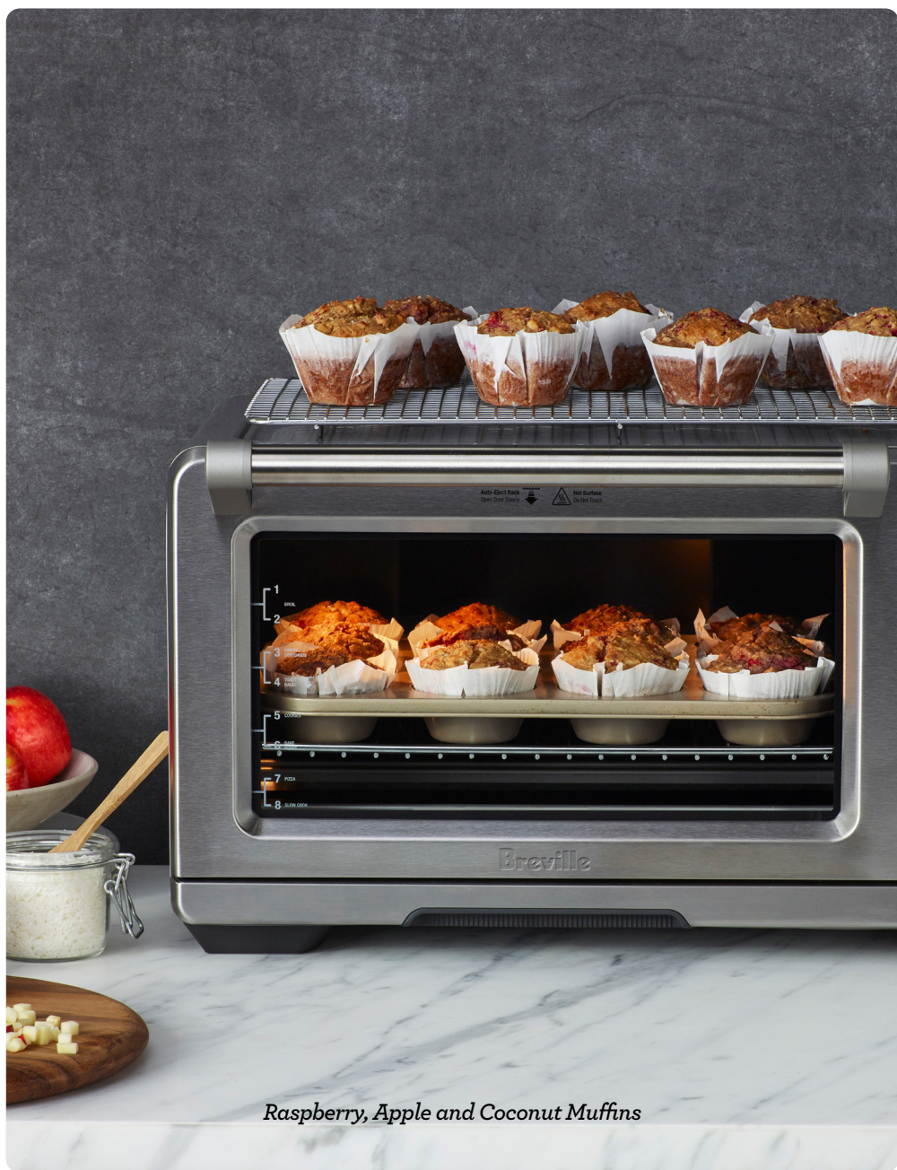
Raspberry, Apple and Coconut Muffins