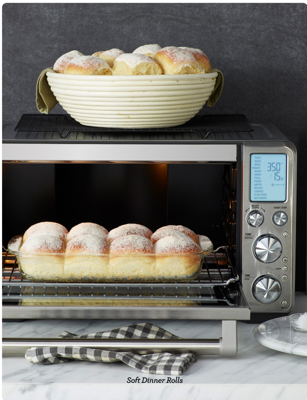
Soft Dinner Rolls