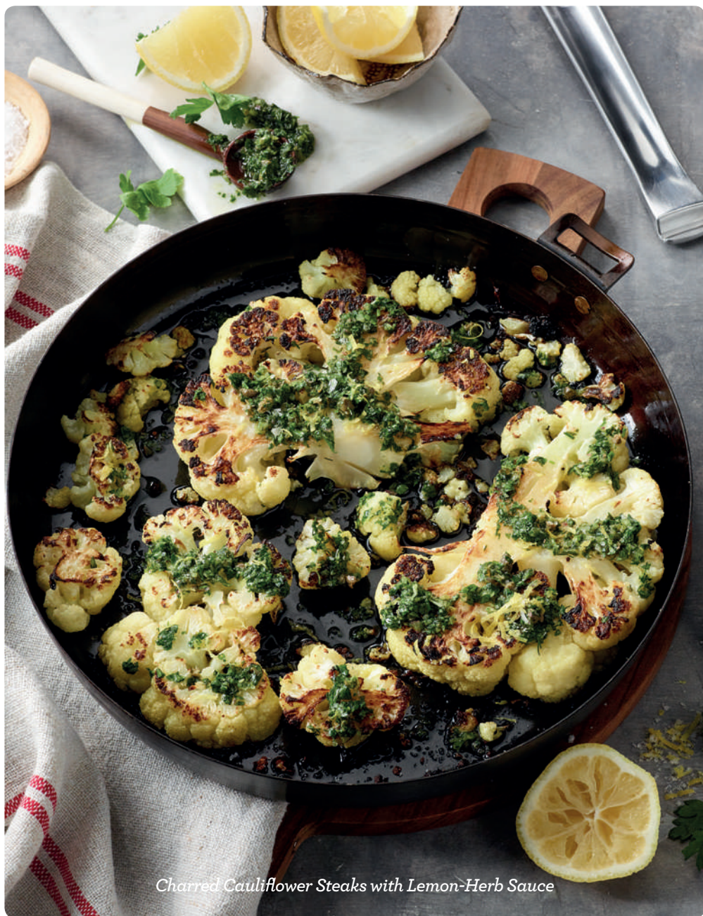
Charred Cauliflower Steaks with Lemon-Herb Sauce