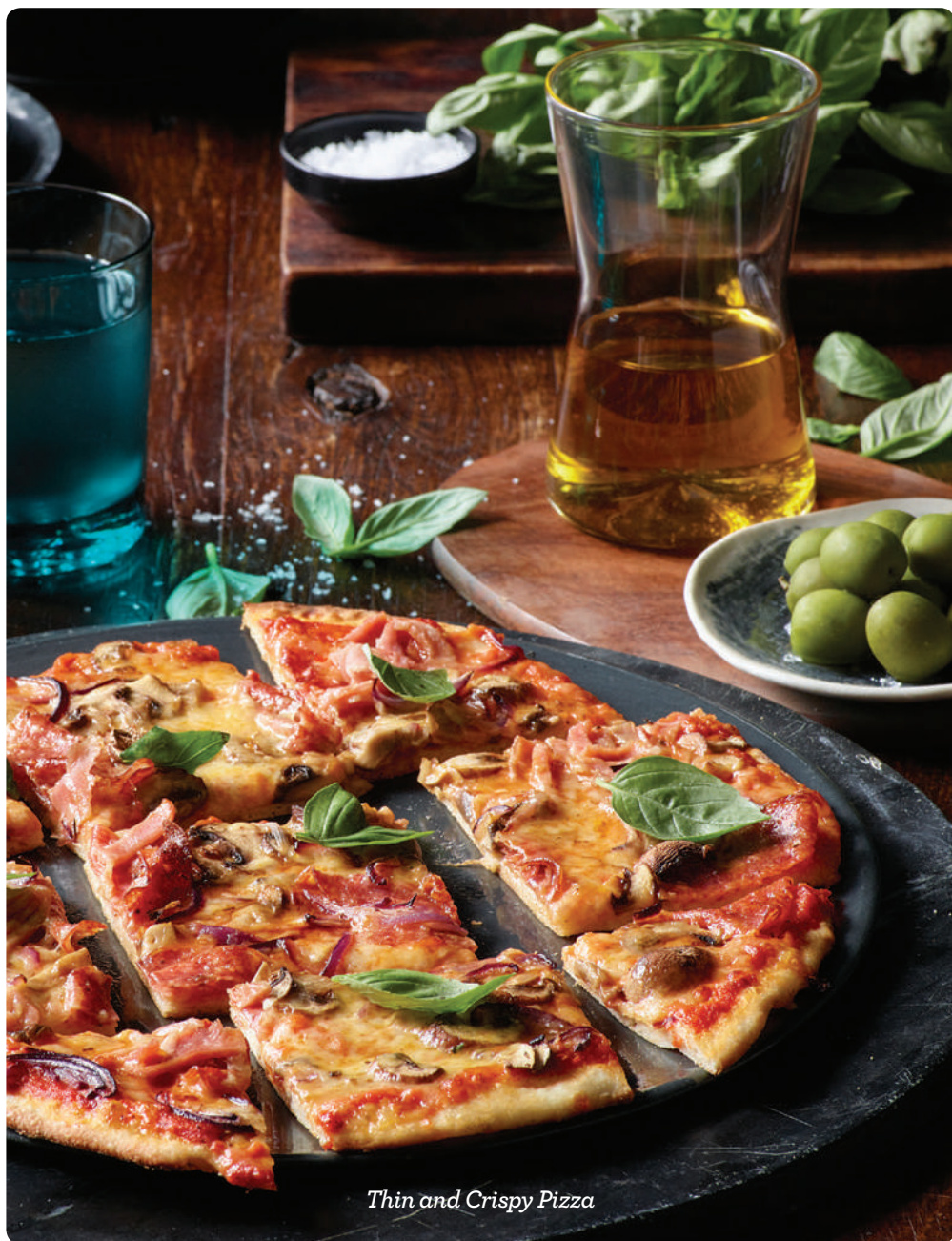
Thin and Crispy Pizza