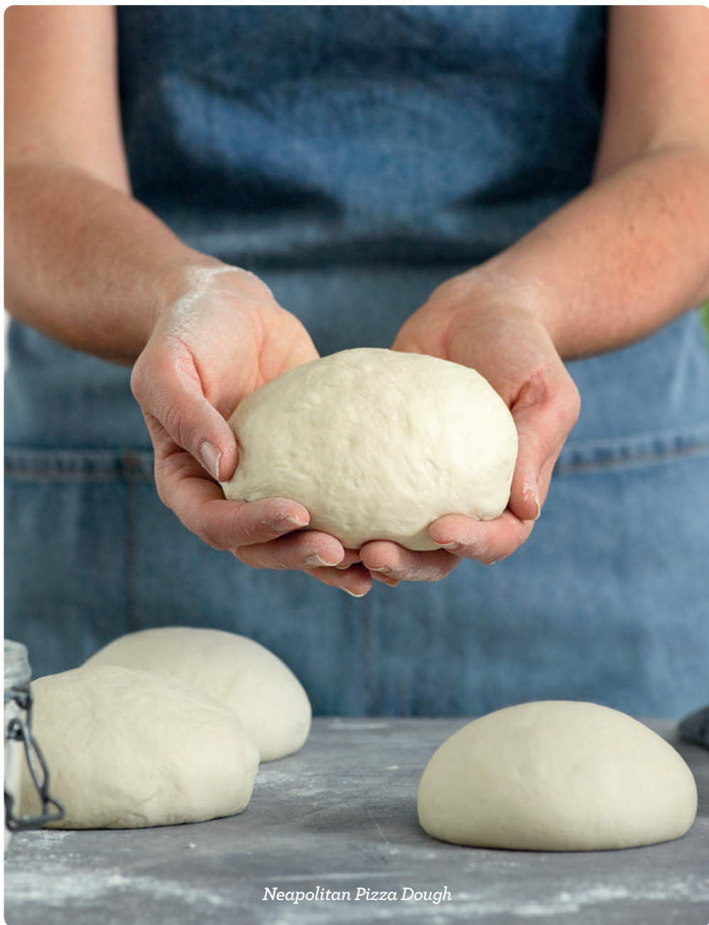
Neapolitan Pizza Dough