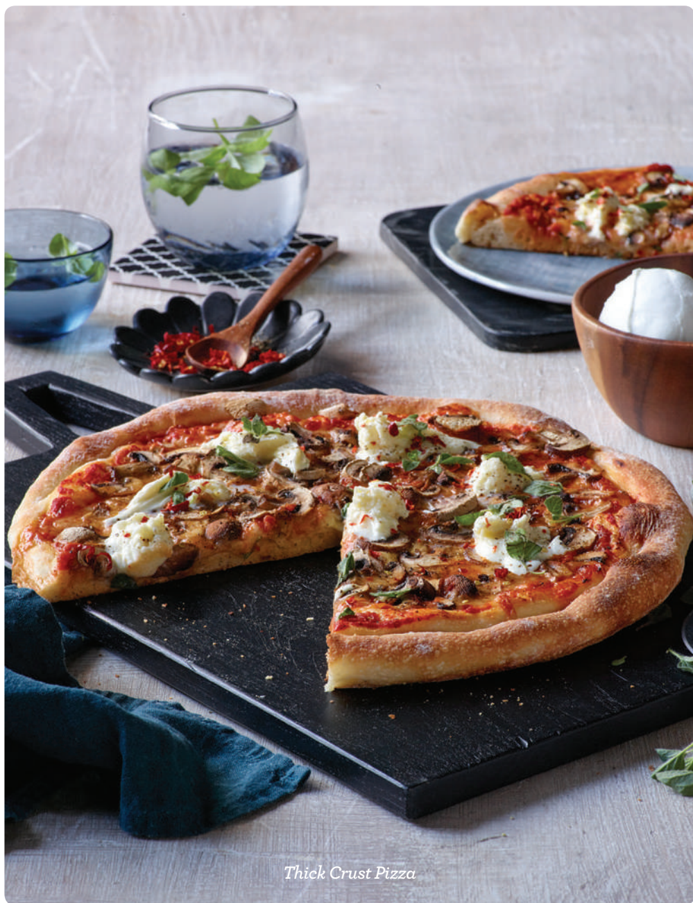
Thick Crust Pizza