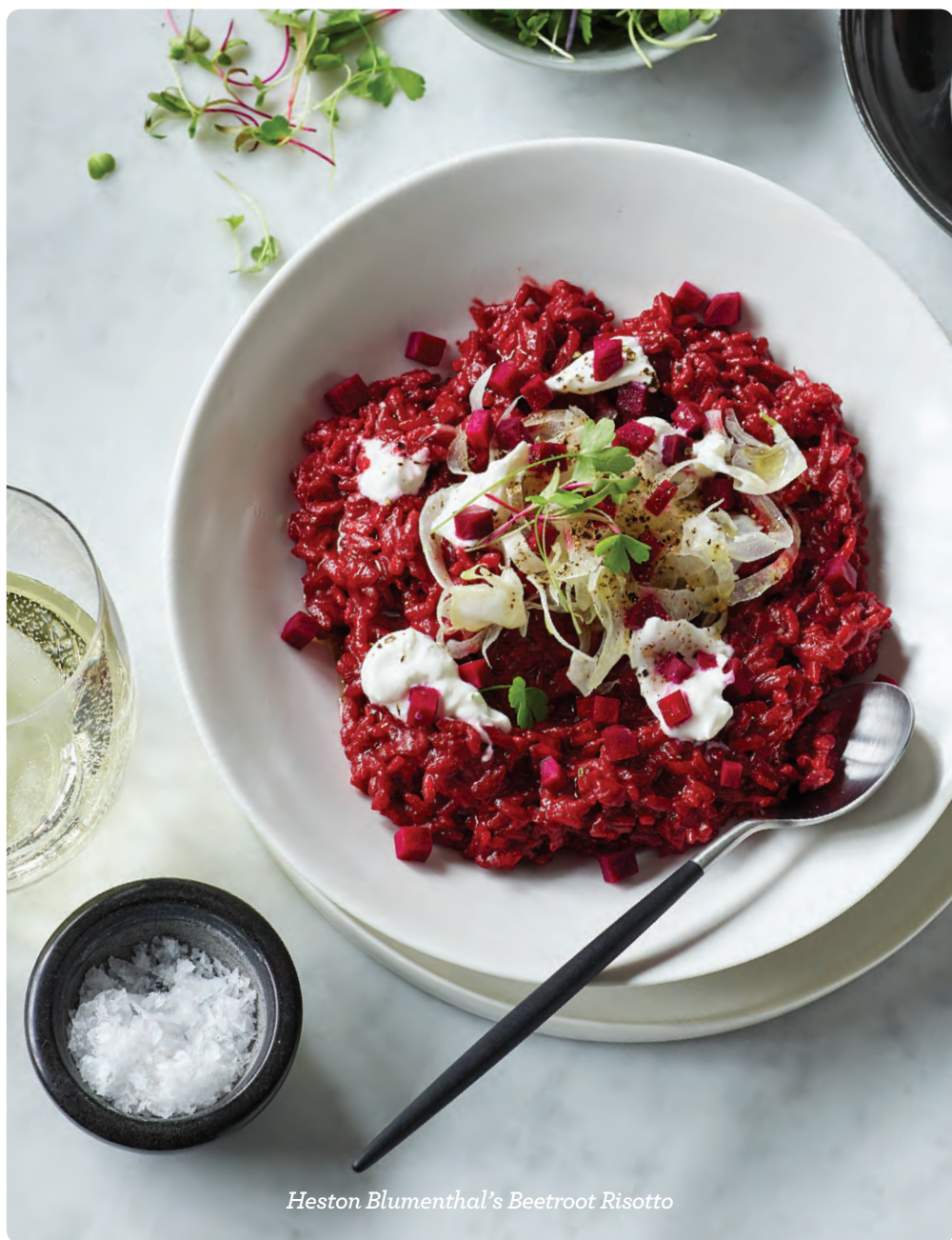
Heston Blumenthal's Beetroot Risotto