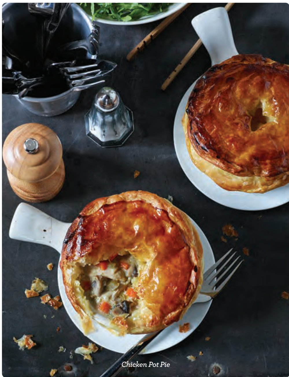
Chicken Pot Pie