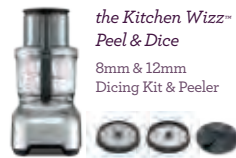
the Kitchen Wizz™ Peel & Dice 8mm & 12mm Dicing Kit & Peeler

1 kg round red or white potatoes (about 8 medium), peeled 2 stalks celery 1 small red onion, peeled 1 cup mayonnaise 2 tablespoons cider vinegar or white wine vinegar 1 teaspoon Dijon mustard 4 hard-cooked eggs, quartered or chopped ½ cup chopped herbs (parsley, tarragon, chives) Coarse salt and freshly ground pepper, to taste