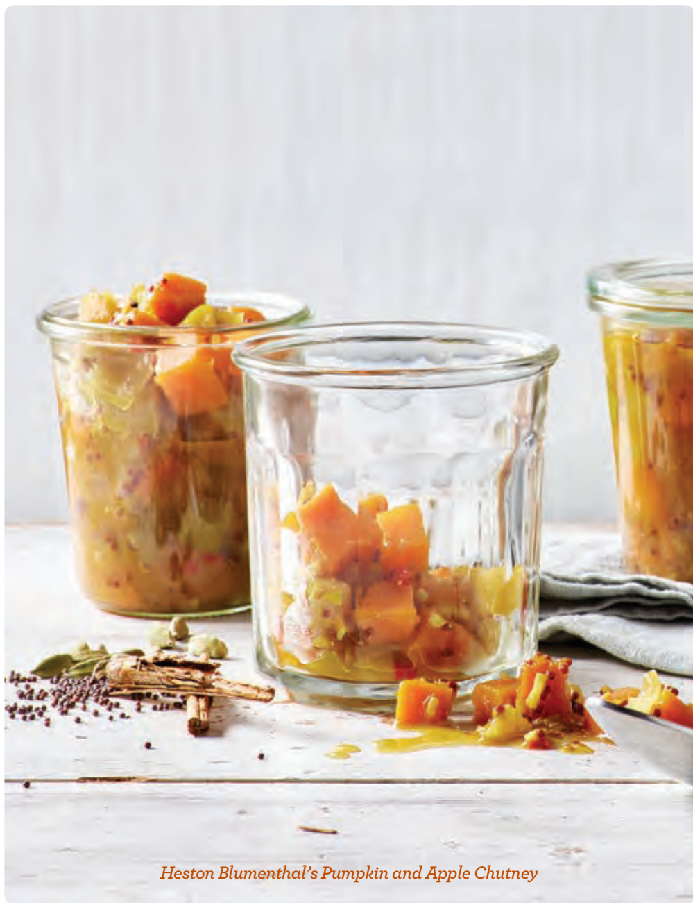
Heston Blumenthal's Pumpkin and Apple Chutney