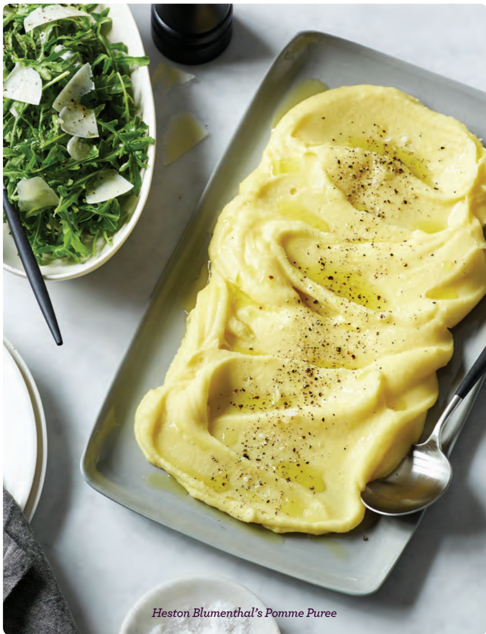
Heston Blumenthal's Pomme Puree