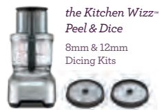
the Kitchen Wizz™ Peel & Dice 8mm & 12mm Dicing Kits

½ cup red onion, peeled 1 capsicum, seeds removed 1 zucchini 3 (150g) yellow squash 6 (80g) mushrooms, sliced 2 tablespoon olive oil ¼ cup coriander, roughly copped Cooking spray 8 mini (8 inch) whole wheat tortillas 1 ¼ cups shredded sharp Cheddar cheese