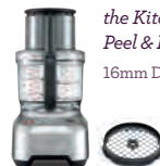
the Kitchen Wizz™ Peel & Dice 16mm Dicing Kit