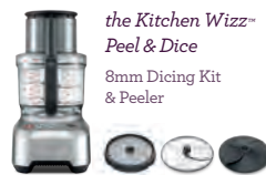
the Kitchen Wizz™ Peel & Dice 8mm Dicing Kit & Peeler