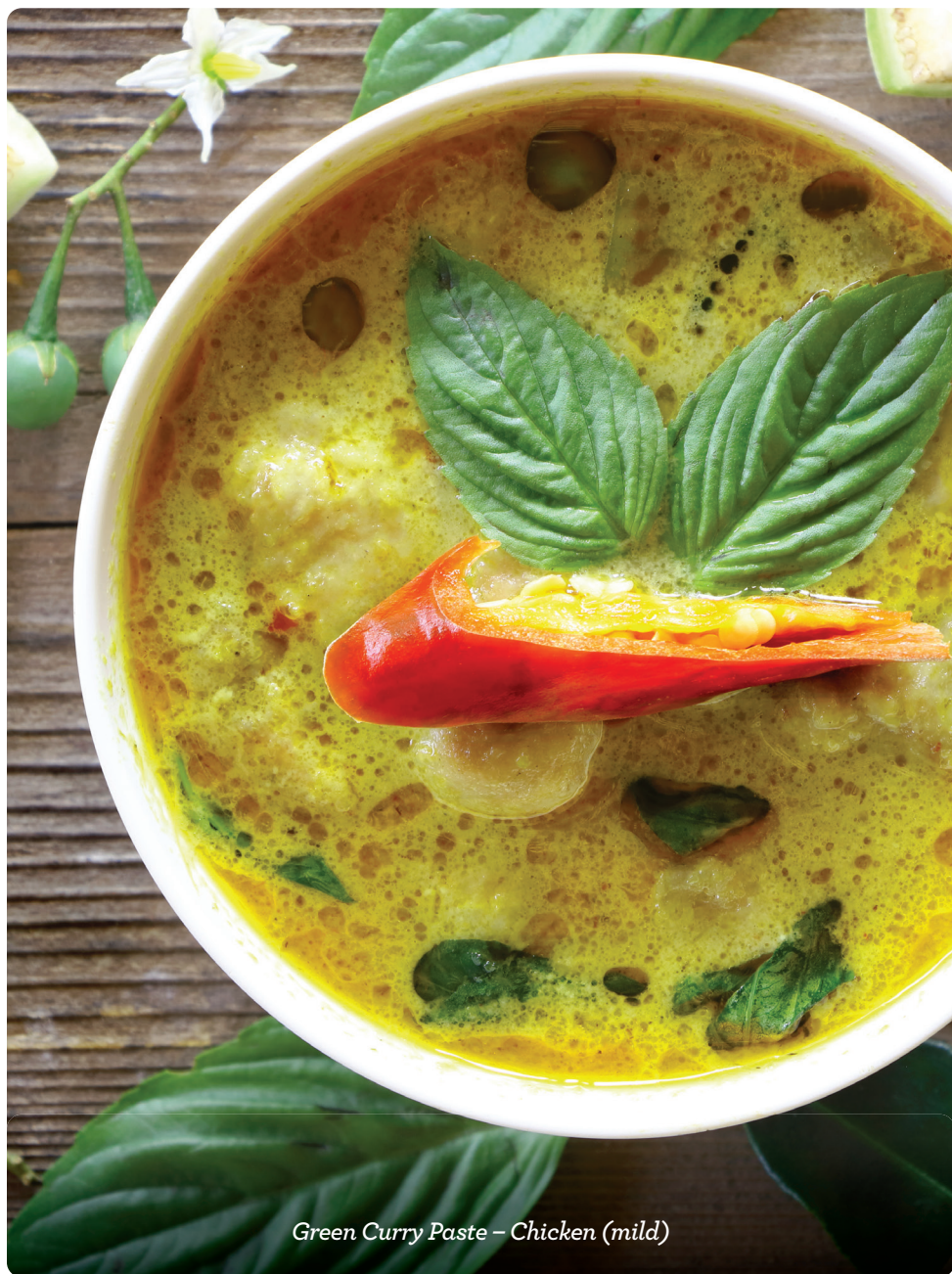
Green Curry Paste – Chicken (mild)