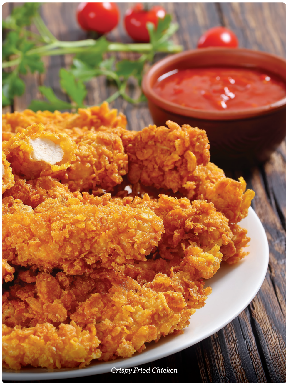
Crispy Fried Chicken