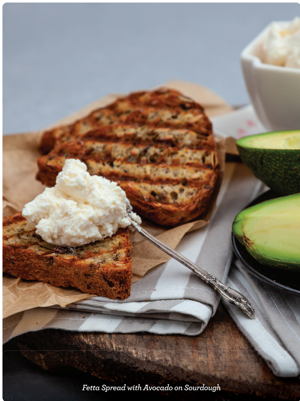
Fetta Spread with Avocado on Sourdough