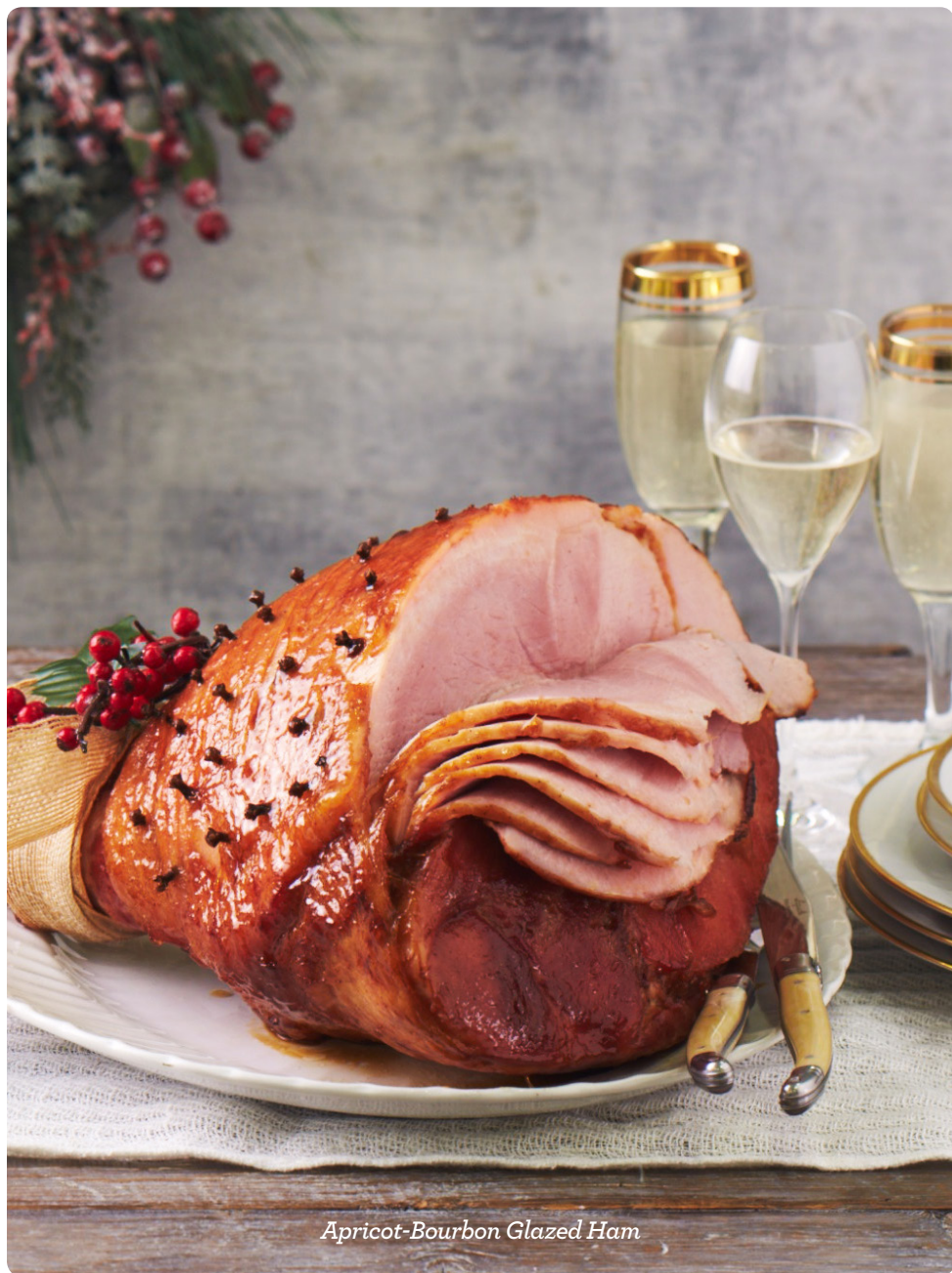
Apricot-Bourbon Glazed Ham