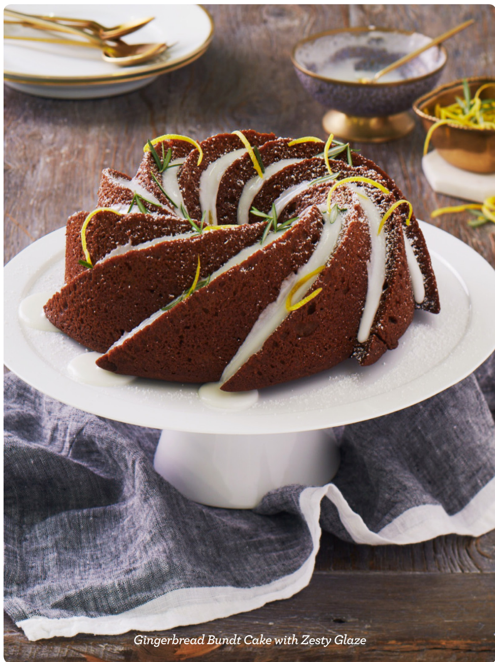
Gingerbread Bundt Cake with Zesty Glaze