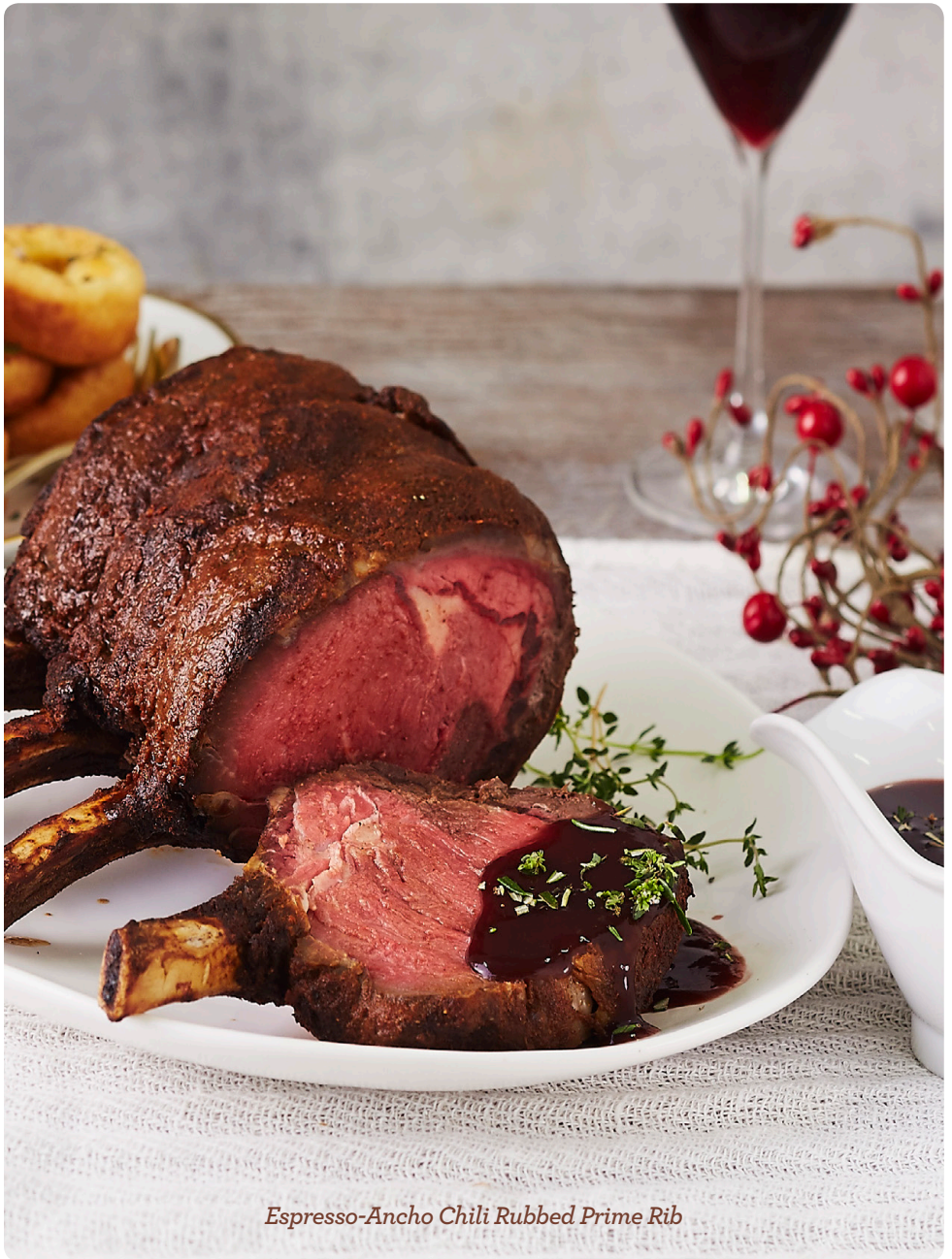
Espresso-Ancho Chili Rubbed Prime Rib