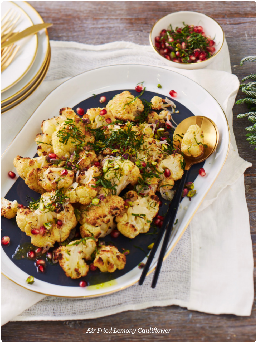
Air Fried Lemony Cauliflower