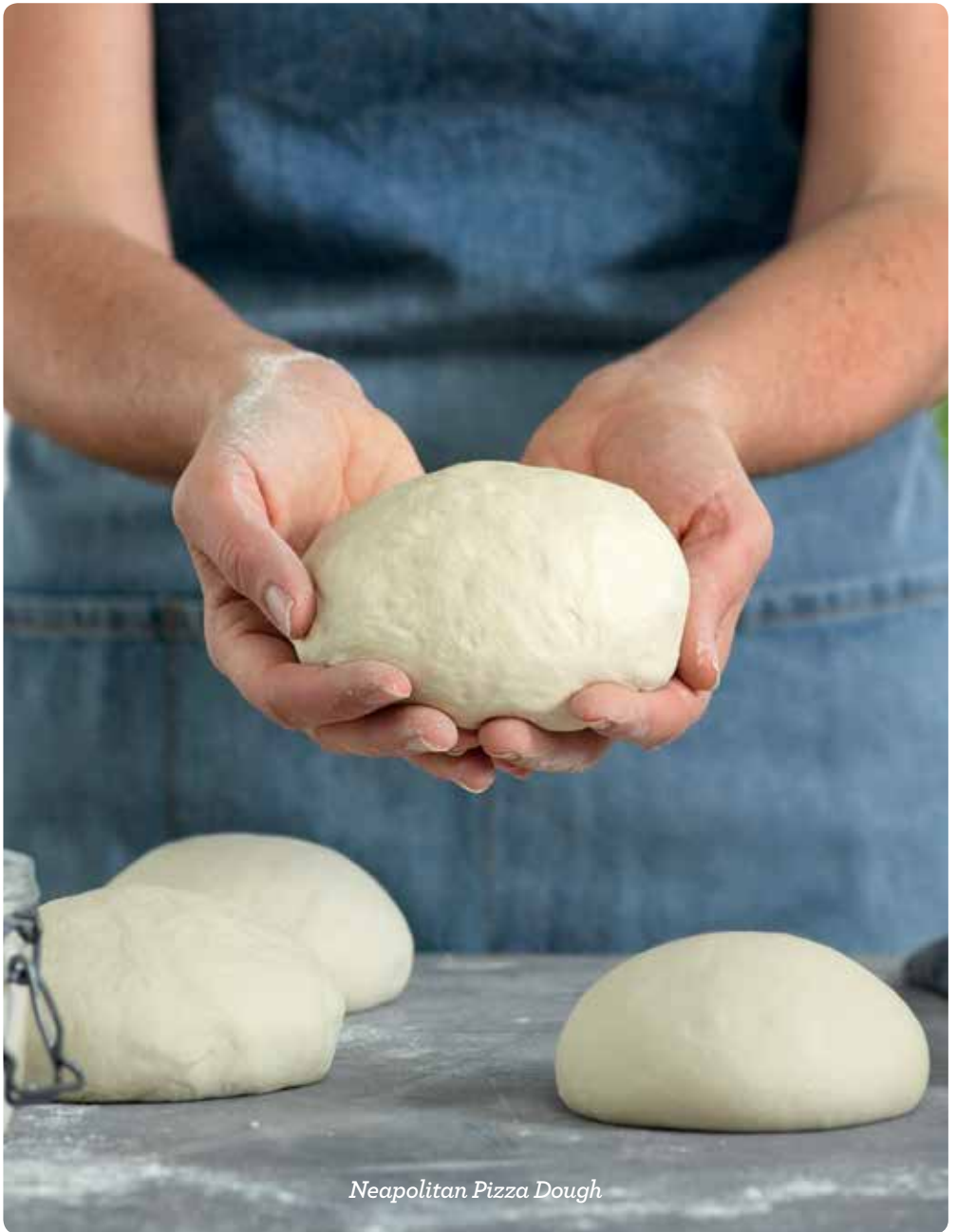
Neapolitan Pizza Dough