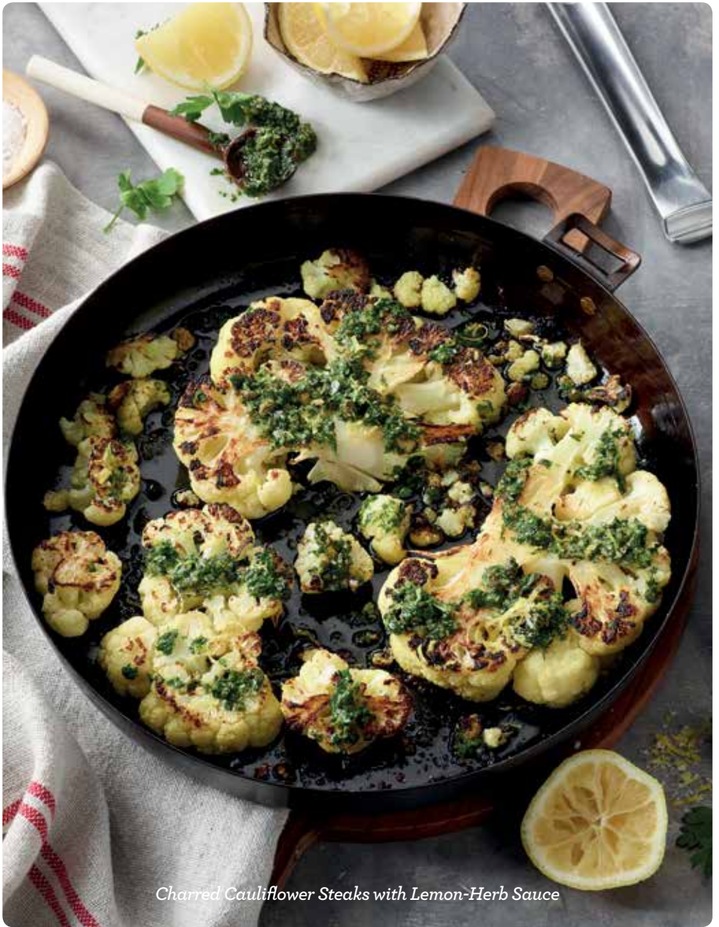
Charred Cauliflower Steaks with Lemon-Herb Sauce