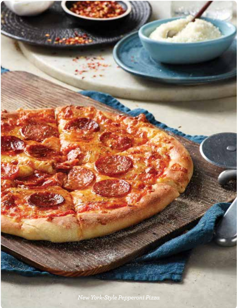
New York-Style Pepperoni Pizza