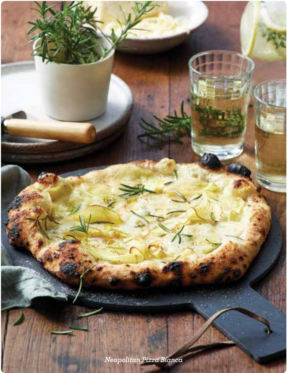
Neapolitan Pizza Bianca