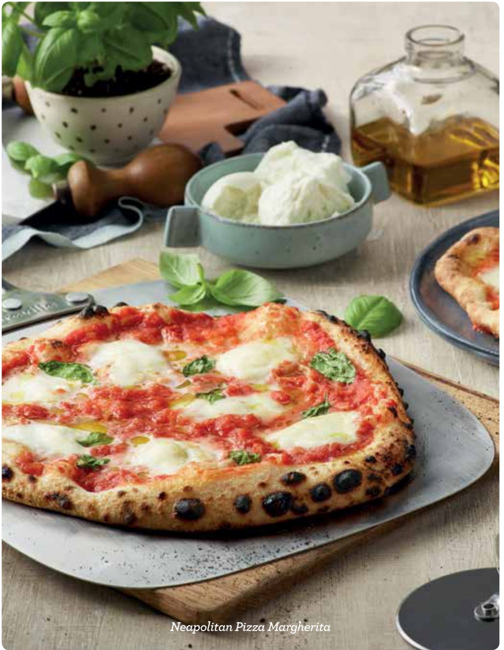
Neapolitan Pizza Margherita