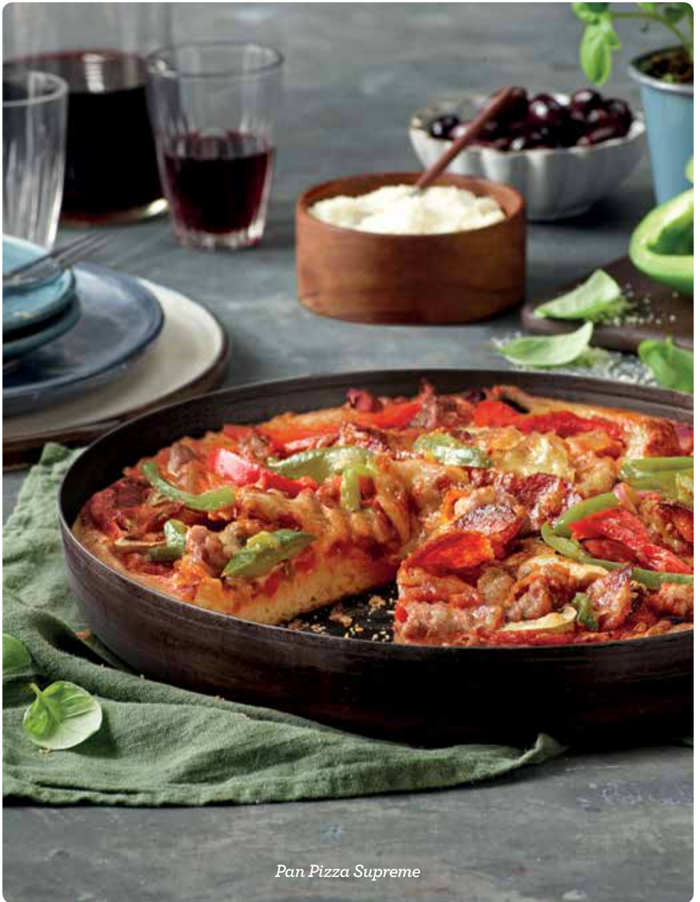
Pan Pizza Supreme