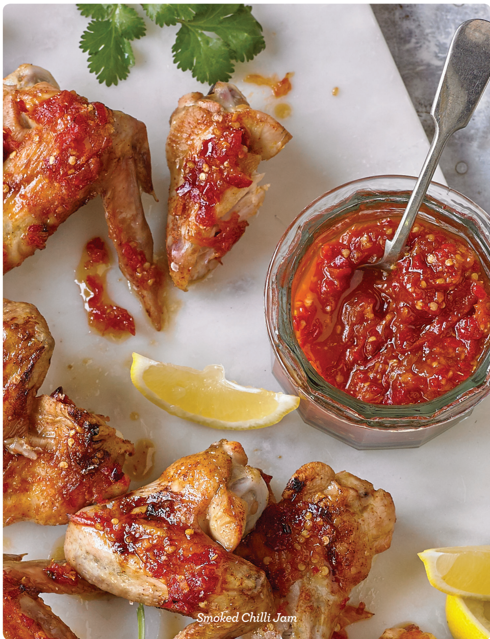
Smoked Chilli Jam