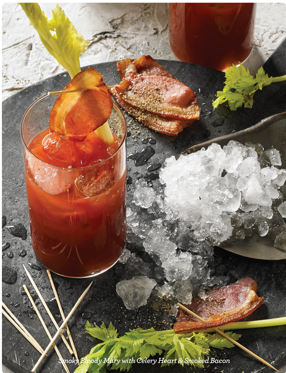
Smoky Bloody Mary with Celery Heart & Smoked Bacon