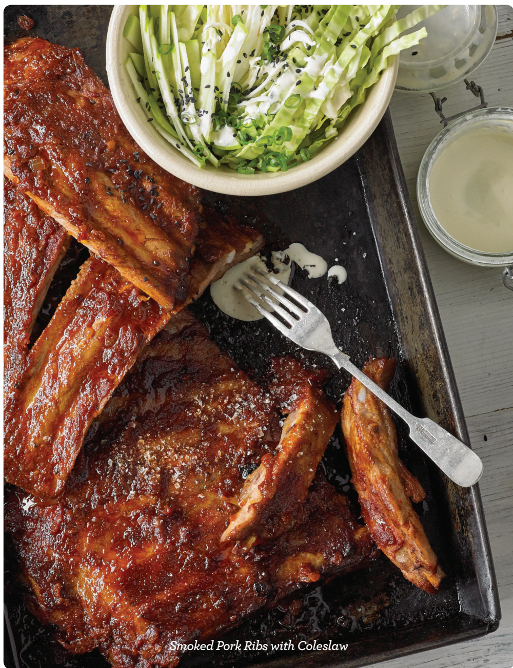
Smoked Pork Ribs with Coleslaw