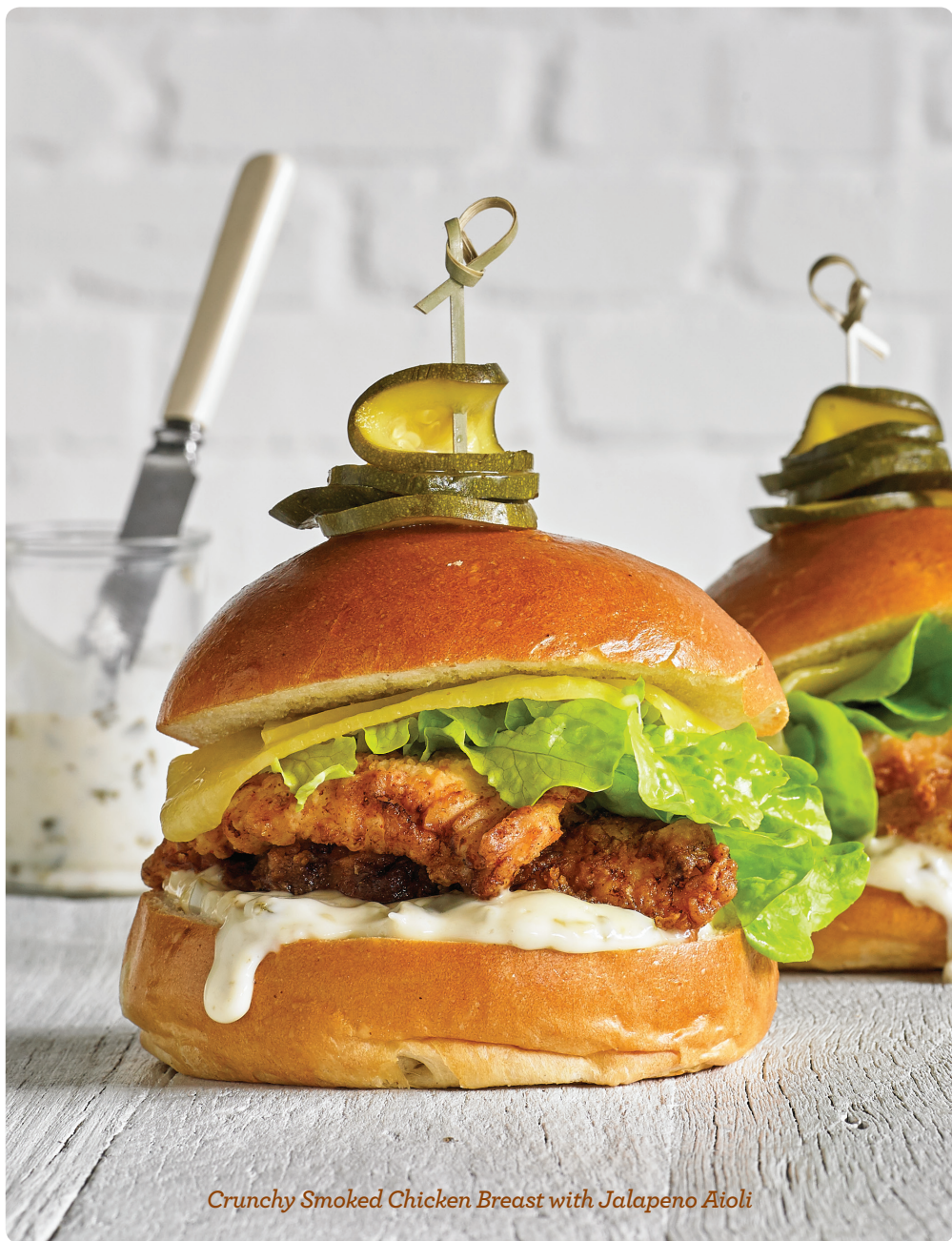
Crunchy Smoked Chicken Breast with Jalapeno Aioli