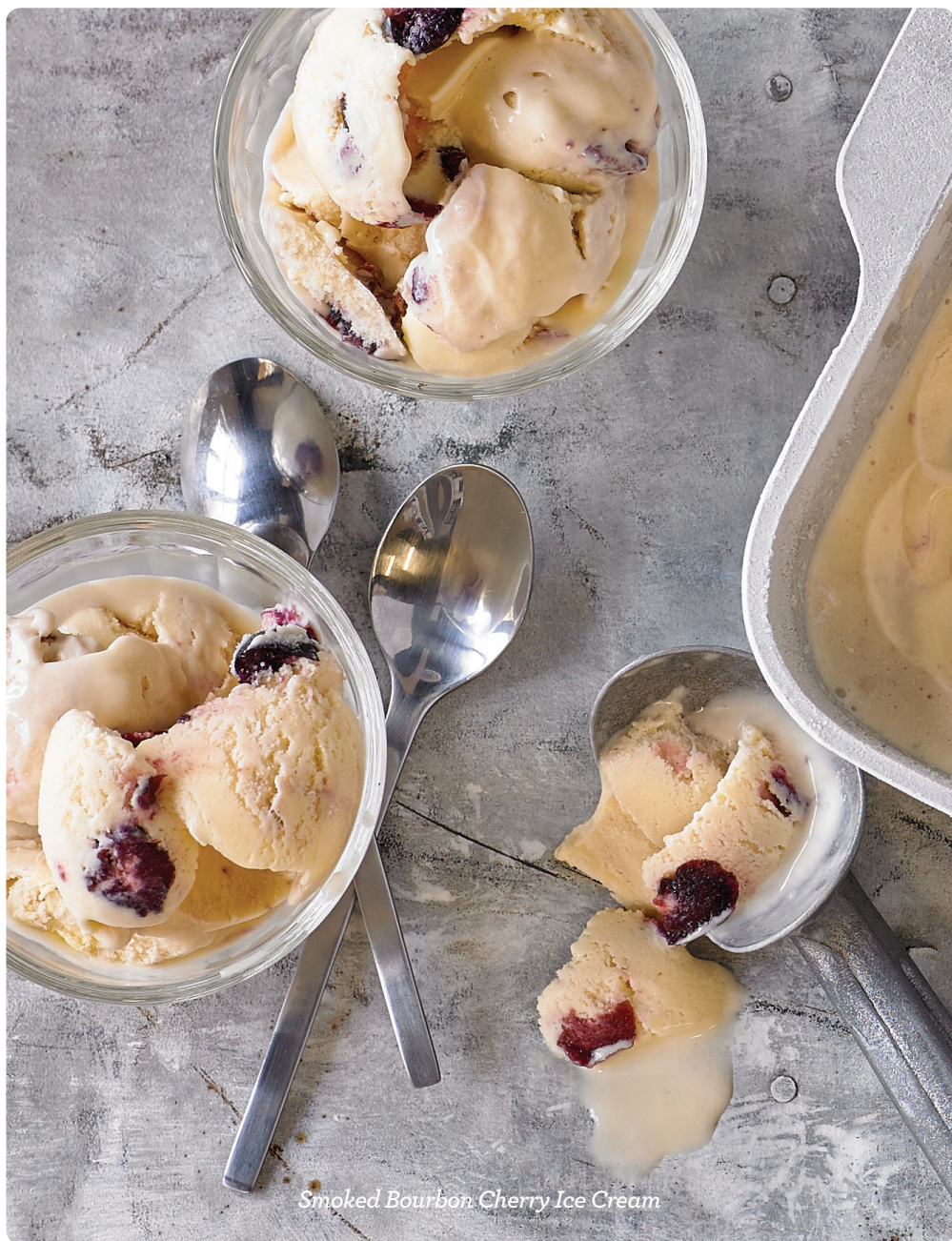
Smoked Bourbon Cherry Ice Cream