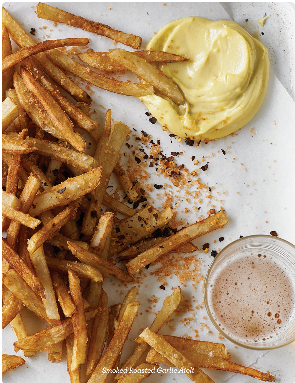
Smoked Roasted Garlic Aioli