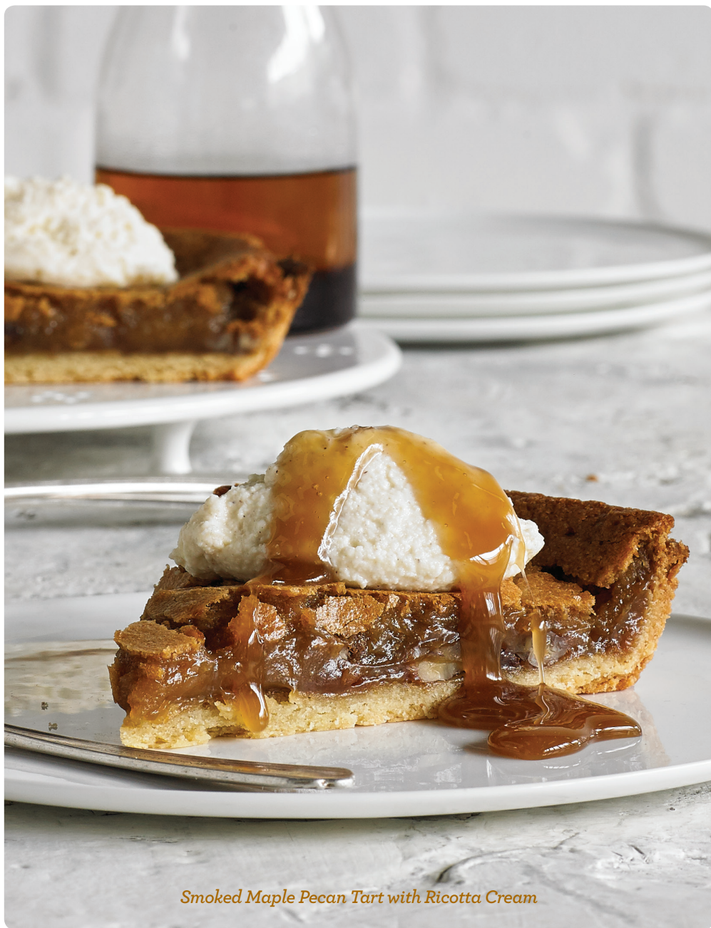
Smoked Maple Pecan Tart with Ricotta Cream