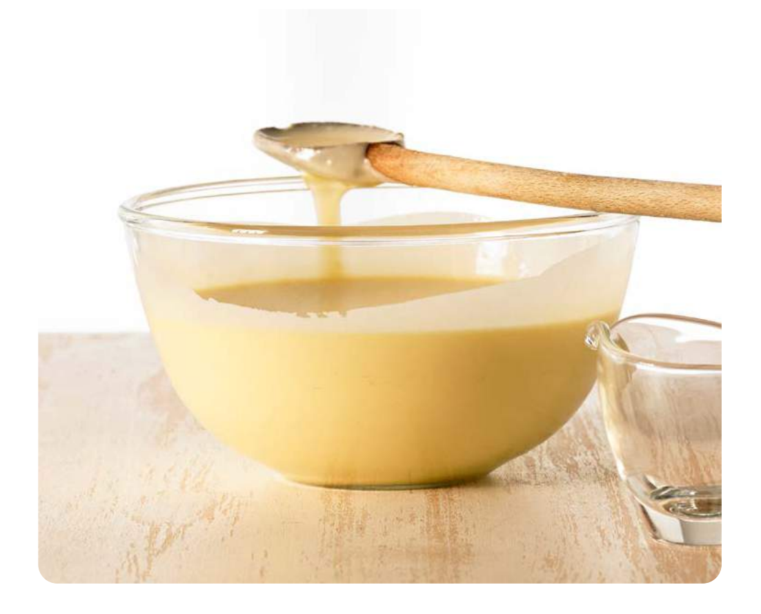
Belgian, Classic, Buttermilk and Chocolate waffle batter