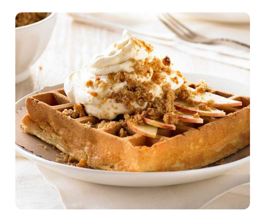
Hot apple pie and coconut crumble