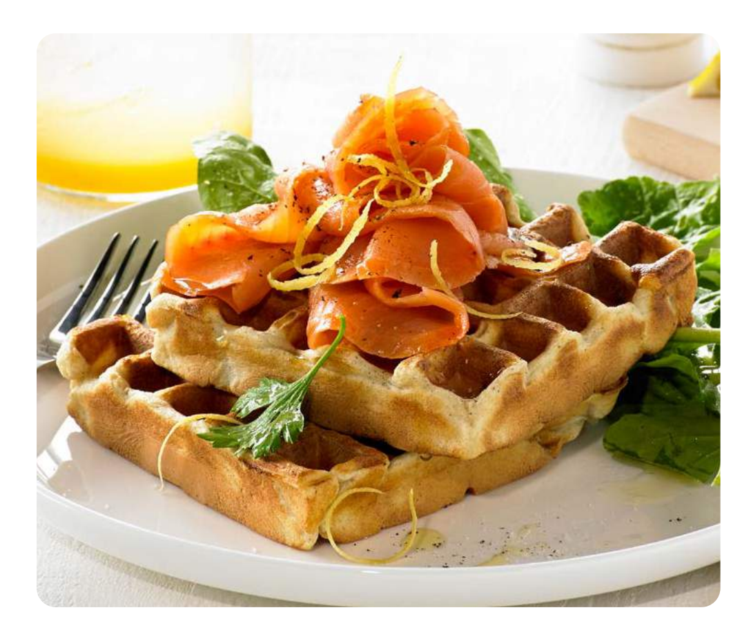
Smoked salmon, dill and caper cream