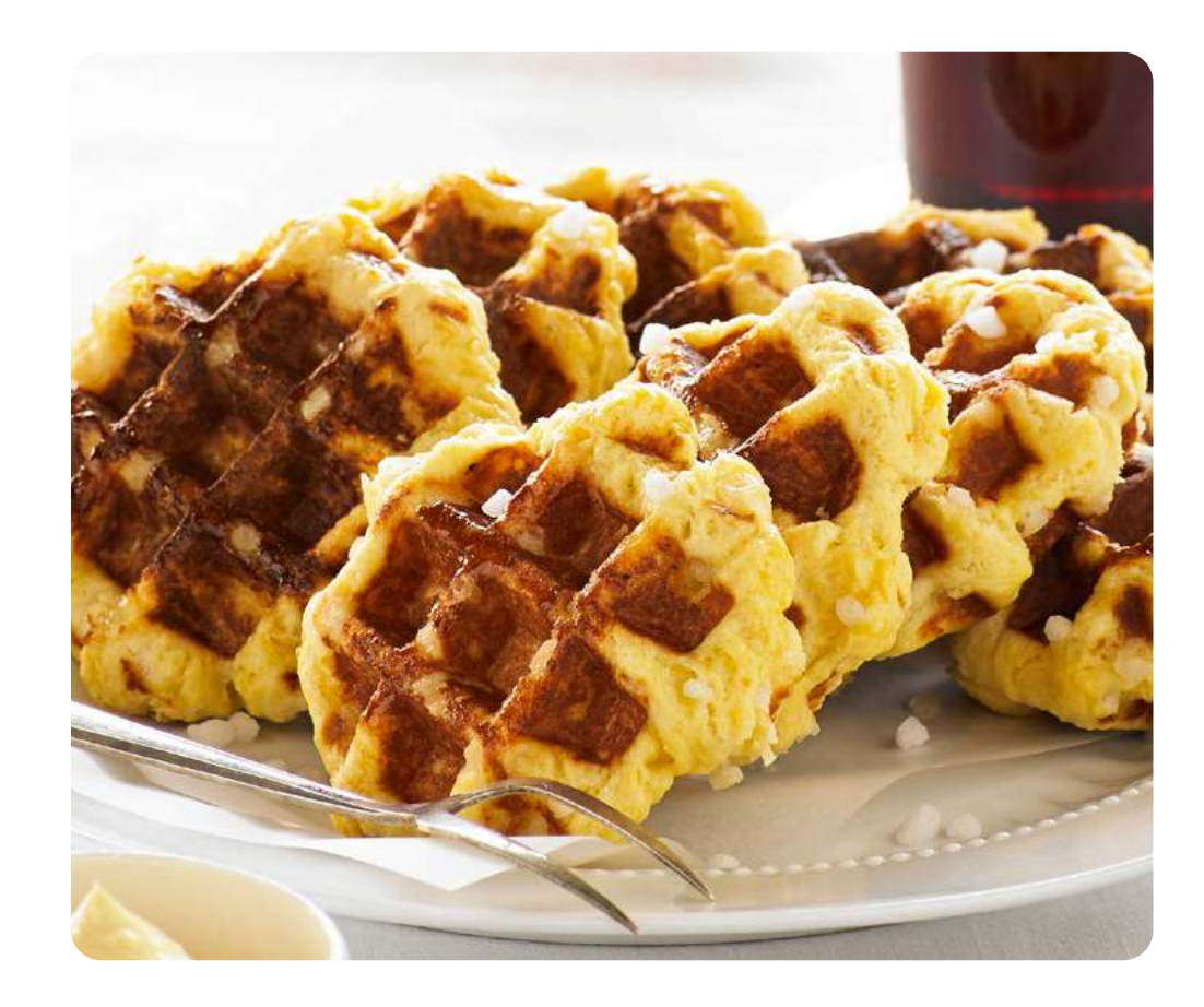
Traditional Belgian Liège