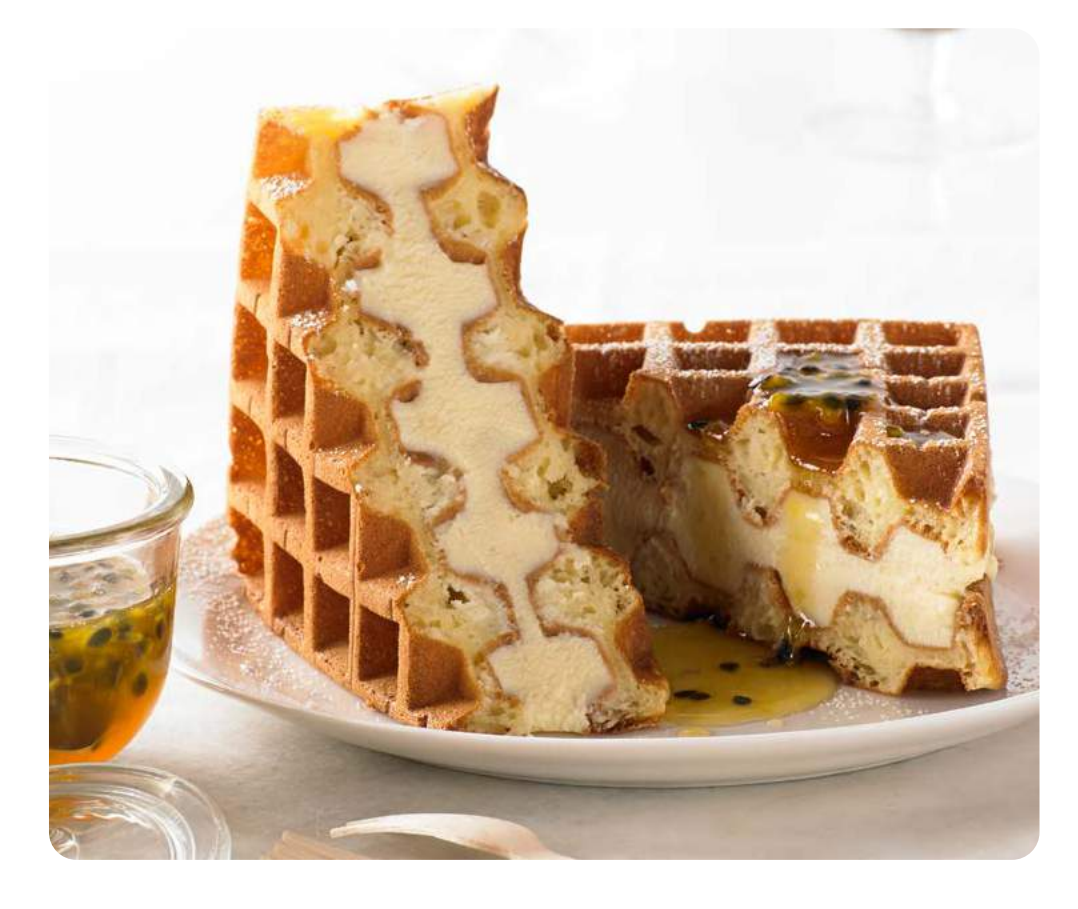
Lemon ricotta cheesecake