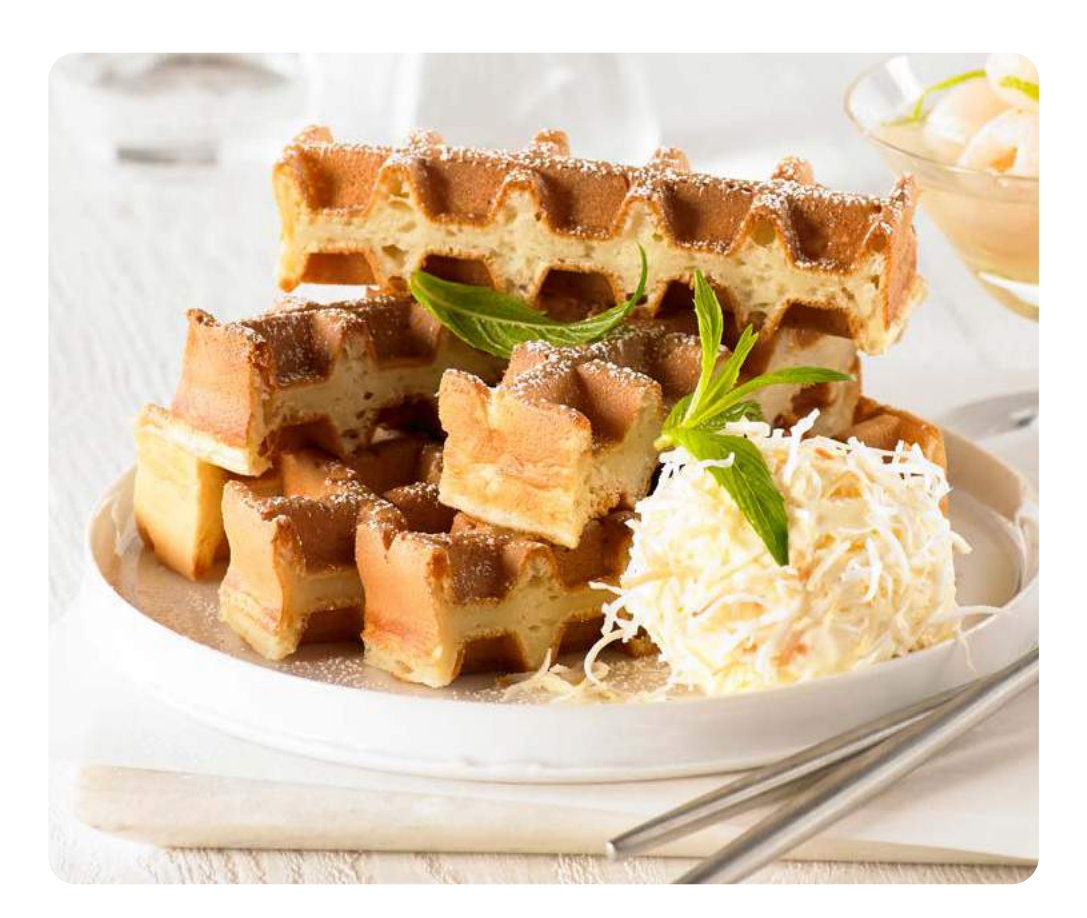
Coconut, lime zest and lychee syrup