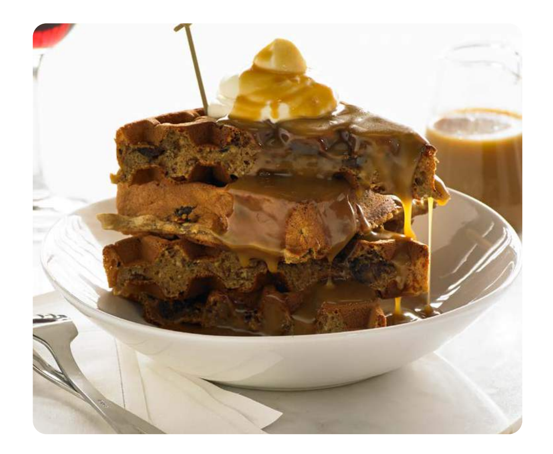
Sticky date and butterscotch sauce