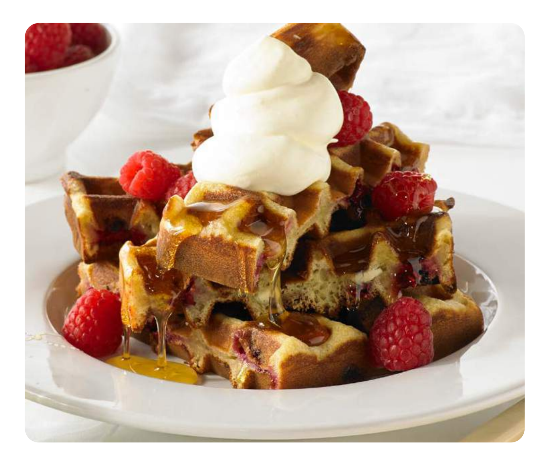
White chocolate and raspberry