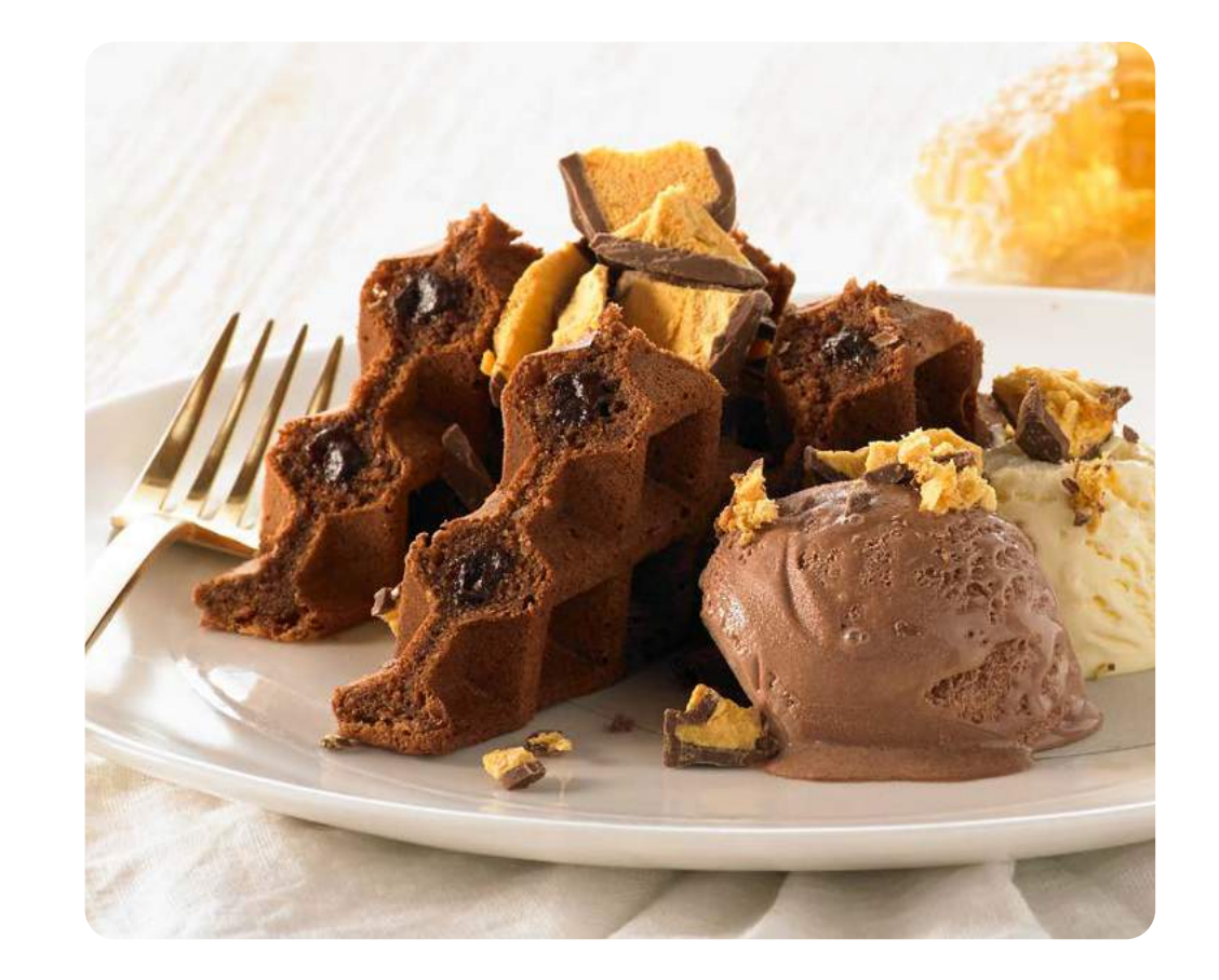
Chocolate and honeycomb