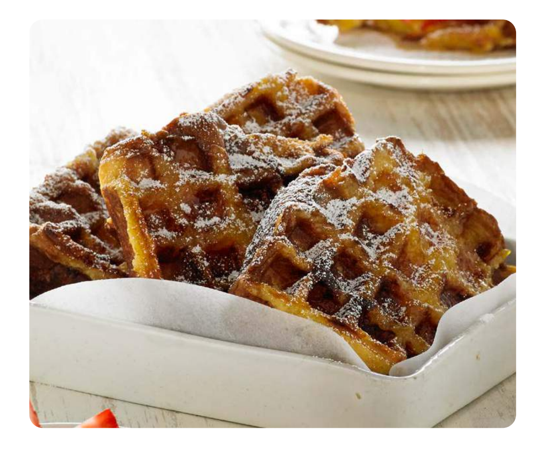
French brioche and marmalade