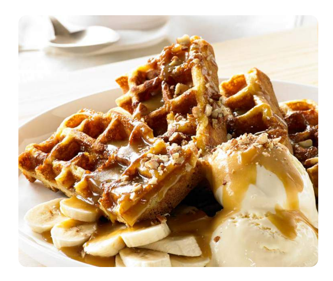
Banana pecan and caramel