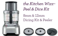
the Kitchen Wizz™ Peel & Dice Kit 8mm & 12mm Dicing Kit & Peeler

½ cup red onion, peeled 1 capsicum, seeds removed 1 zucchini 3 (150g) yellow squash 6 (80g) mushrooms, sliced 2 tablespoon olive oil ¼ cup coriander, roughly copped Cooking spray 8 mini (8 inch) whole wheat tortillas 1 ¼ cups shredded sharp Cheddar cheese