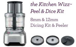
the Kitchen Wizz™ Peel & Dice Kit 8mm & 12mm Dicing Kit & Peeler

1 large onion, peeled 2 medium size carrots, peeled 2 celery sticks 40g butter 1 tablespoon olive oil 300g button mushrooms, quartered 2 cloves garlic, minced ½ cup cognac (or white wine) 4 tbs plain flour