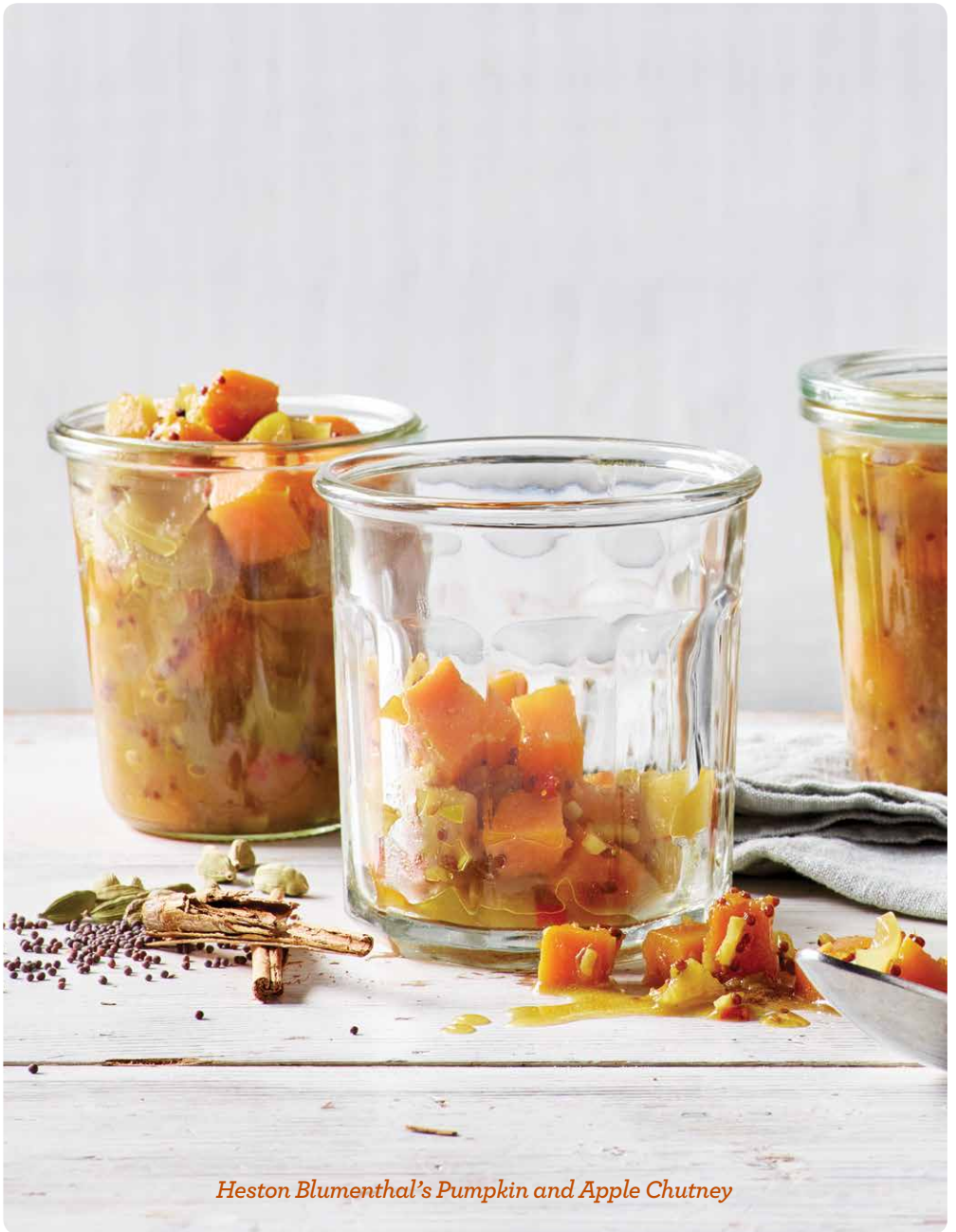
Heston Blumenthal's Pumpkin and Apple Chutney