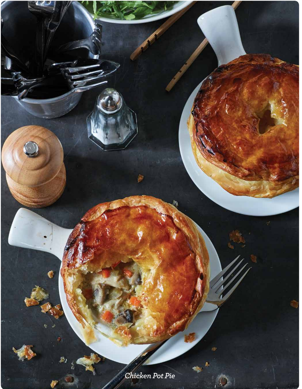
Chicken Pot Pie