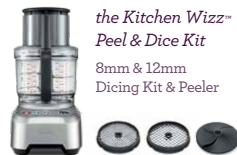
the Kitchen Wizz™ Peel & Dice Kit 8mm & 12mm Dicing Kit & Peeler

1 kg round red or white potatoes (about 8 medium), peeled 2 stalks celery 1 small red onion, peeled 1 cup mayonnaise 2 tablespoons cider vinegar or white wine vinegar 1 teaspoon Dijon mustard 4 hard-cooked eggs, quartered or chopped ½ cup chopped herbs (parsley, tarragon, chives) Coarse salt and freshly ground pepper, to taste