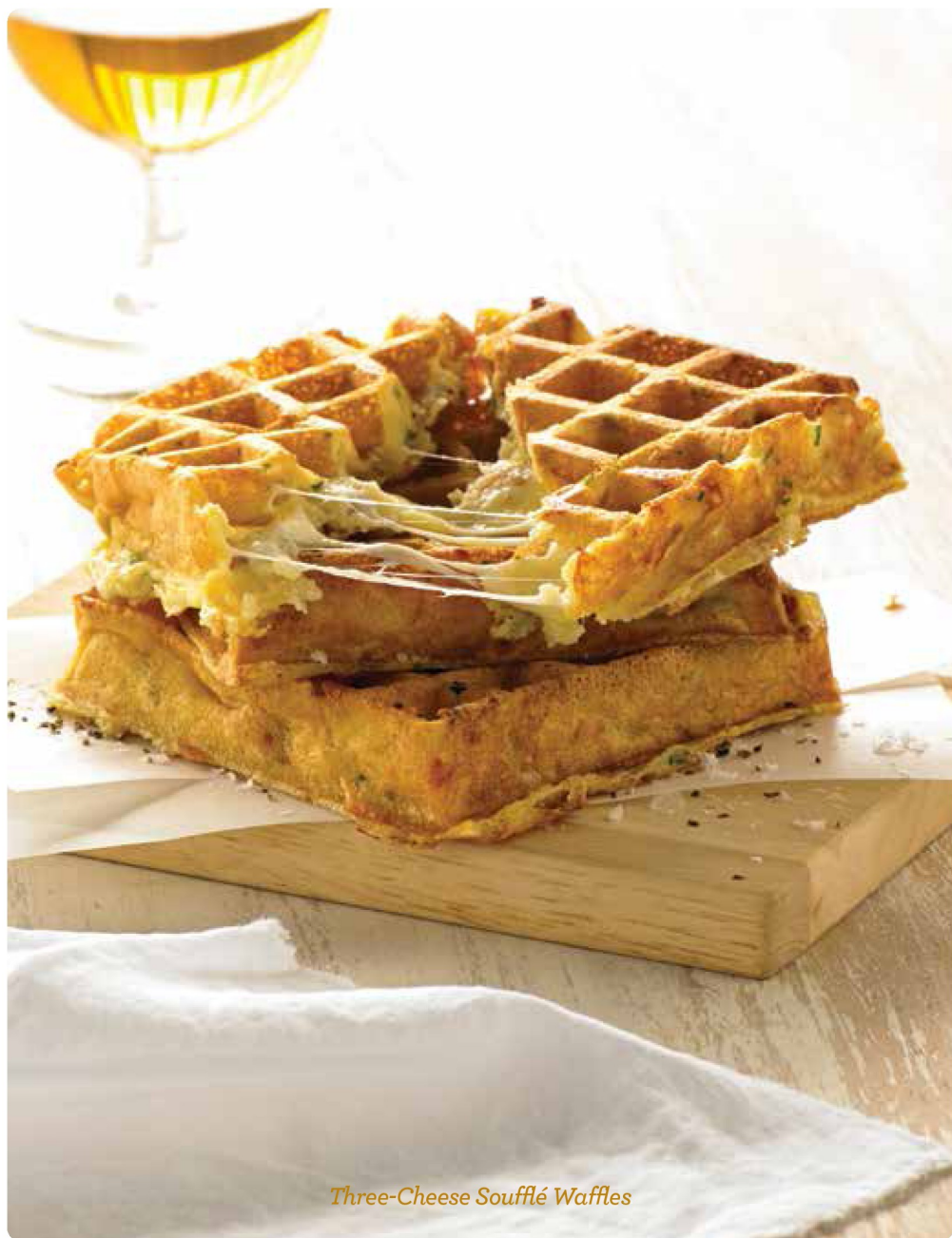
Three-Cheese Soufflé Waffles