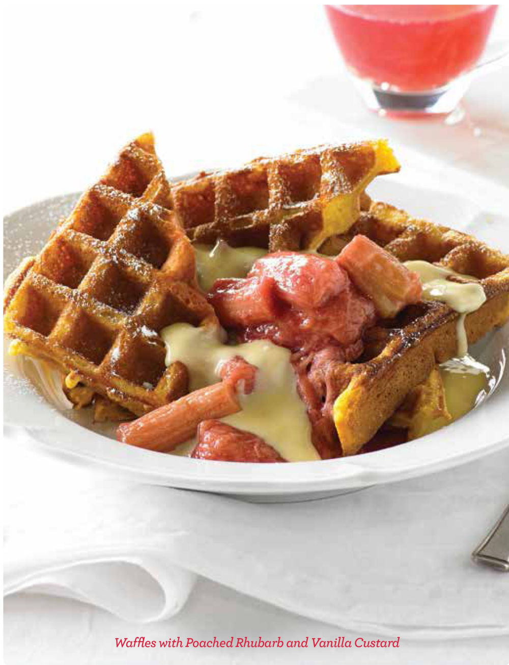
Waffles with Poached Rhubarb and Vanilla Custard