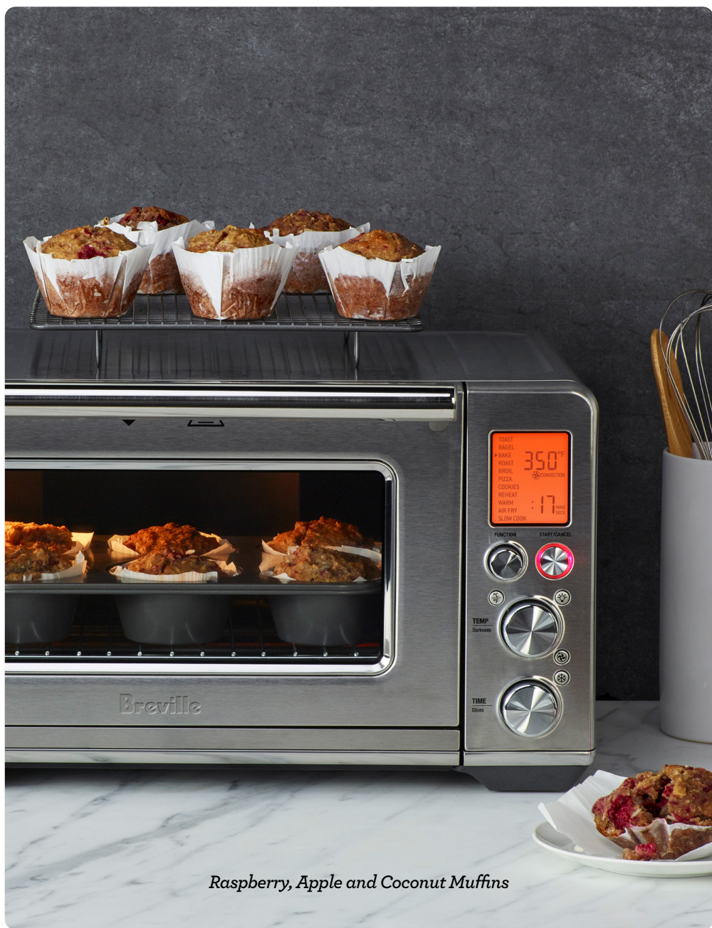
Raspberry, Apple and Coconut Muffins