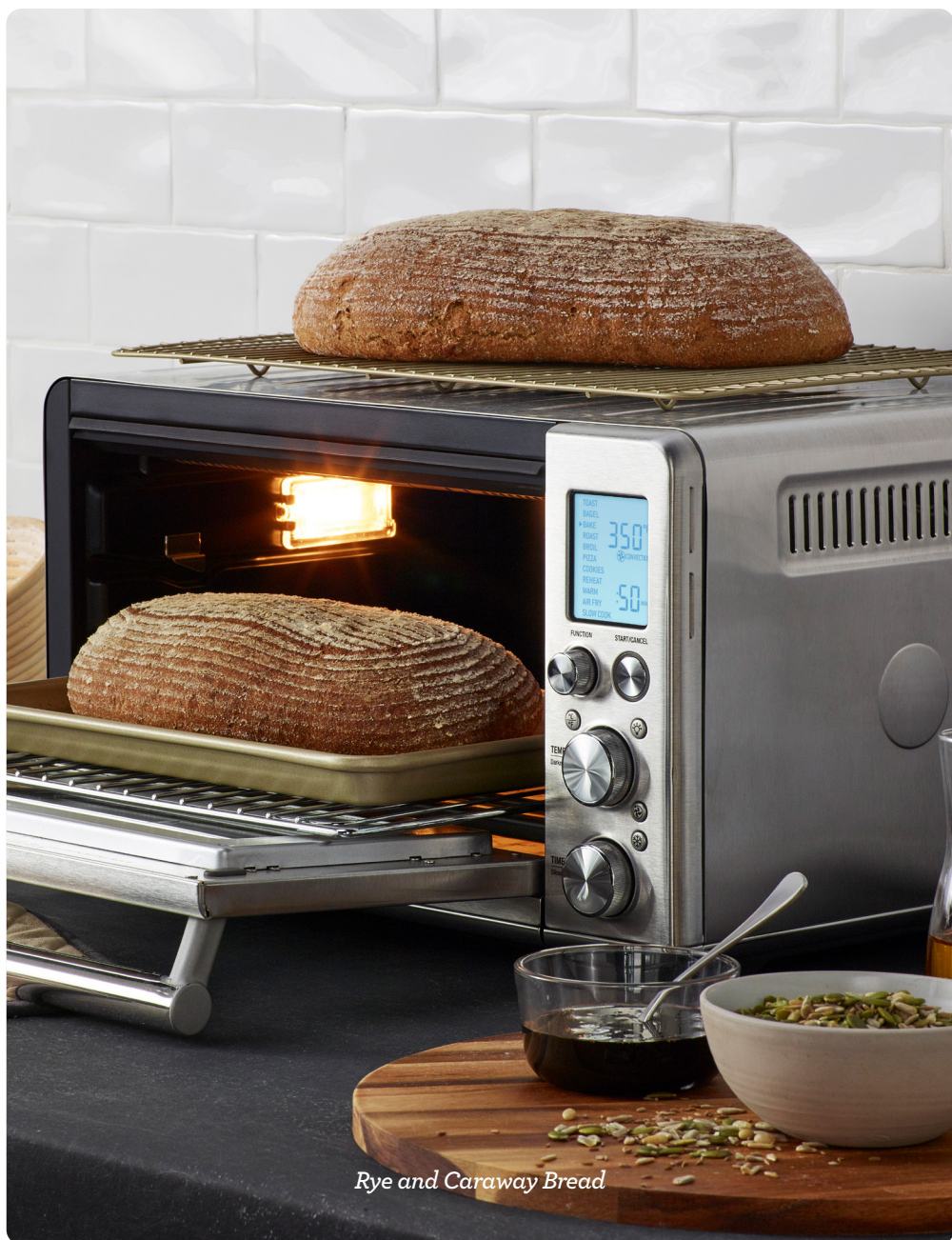
Rye and Caraway Bread